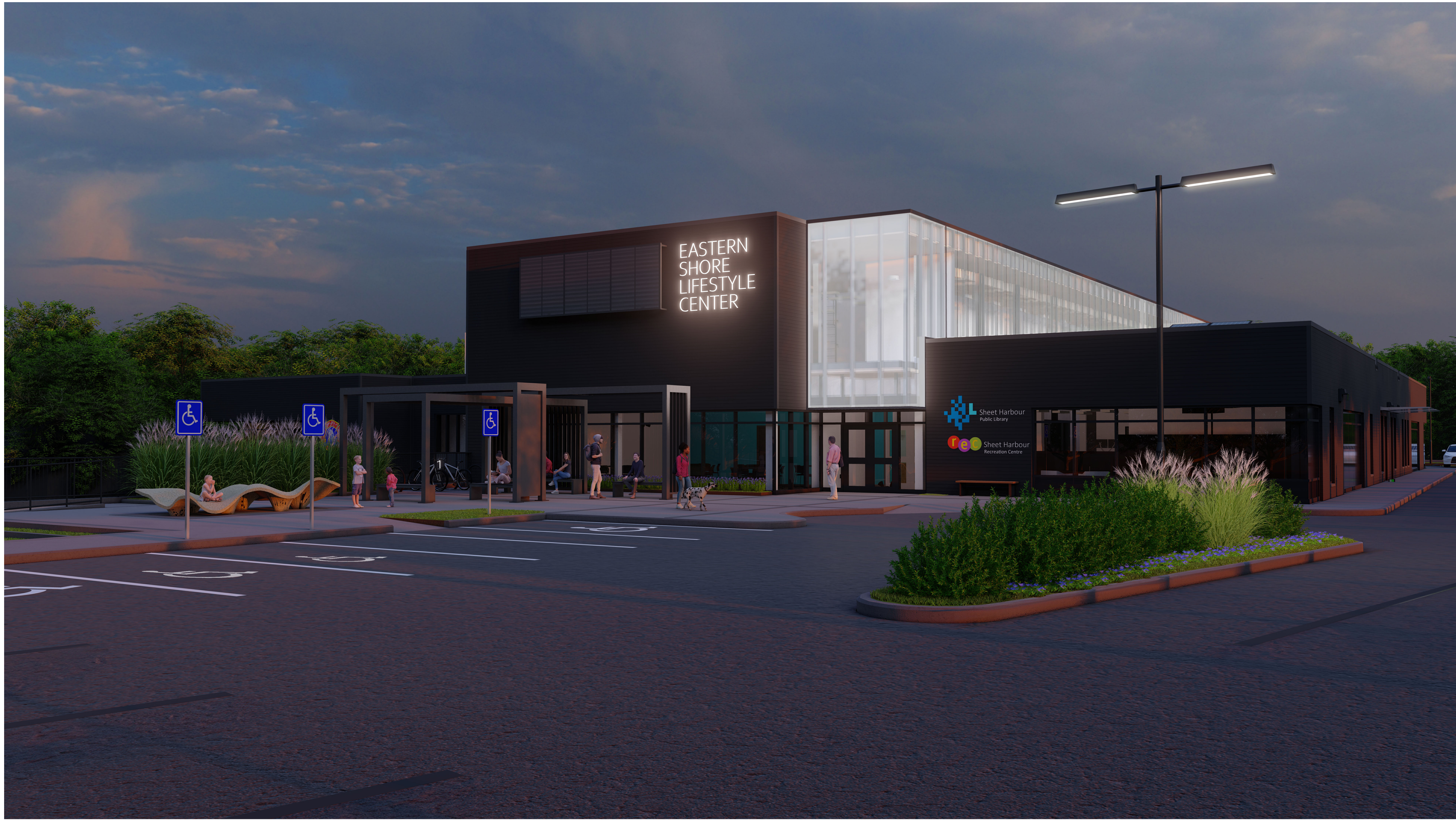
LIFESTYLE CENTRE ENTRY- NIGHT