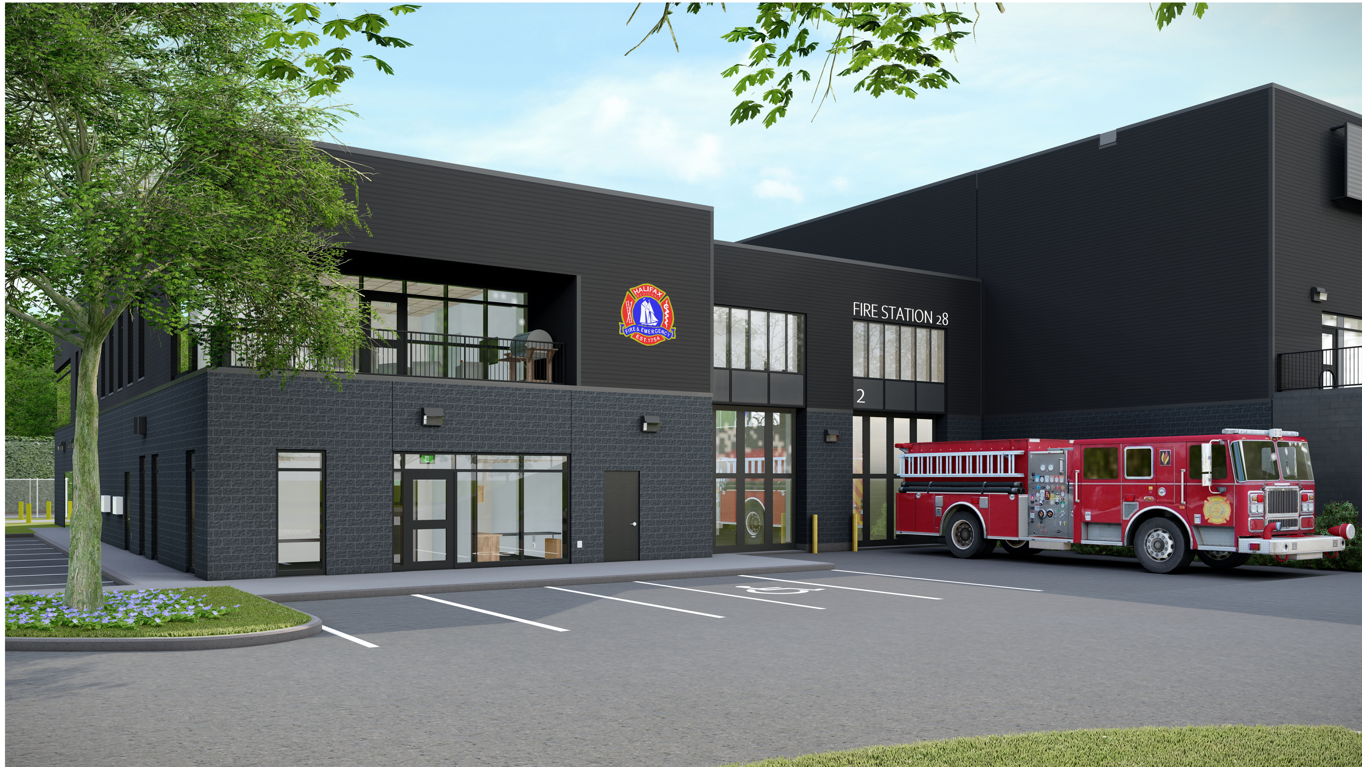
FIRE STATION ENTRY