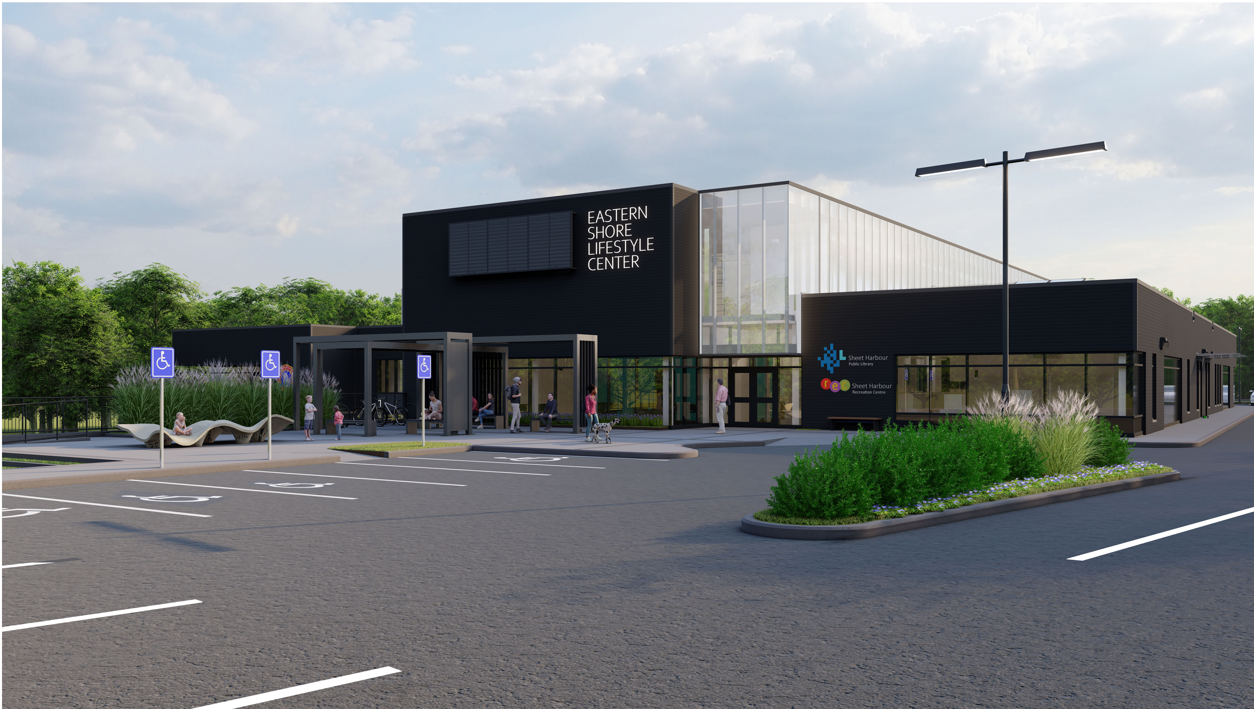
LIFESTYLE CENTRE ENTRY