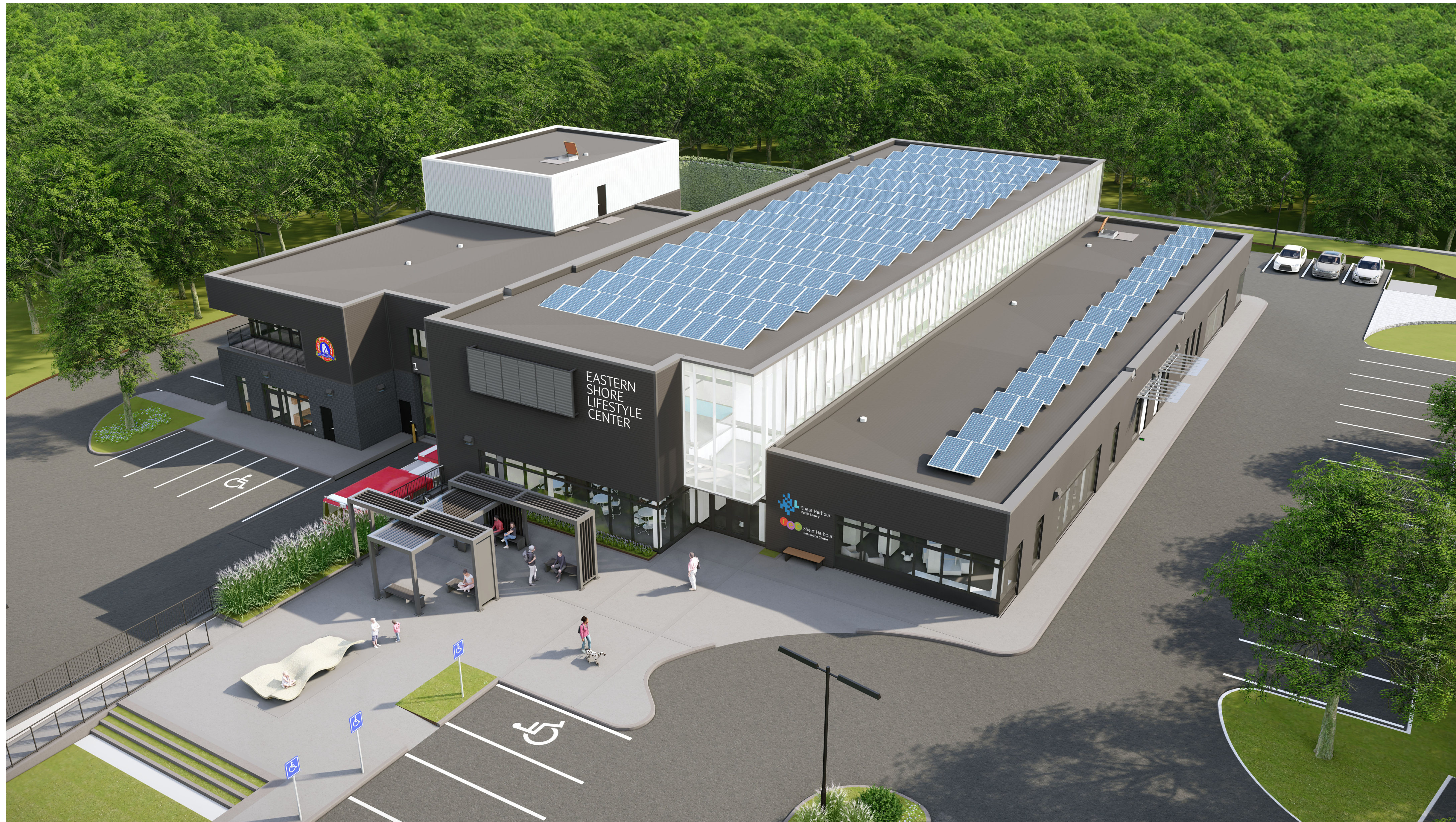
FACILITY AERIAL VIEW