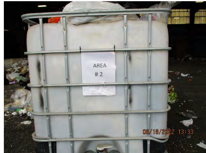
Photo 6: Waste audit sample from HRM collection Area 2. Photo collected August 18, 2022.