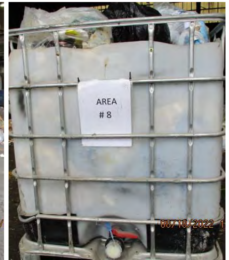
Photo 30: Waste audit sample from HRM collection Area 8. Photo collected August 18, 2022.