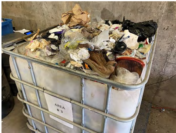
Photo 11: Waste audit sample from HRM collection Area 3 following sorting. Photo collected August 30, 2022 during waste audit.