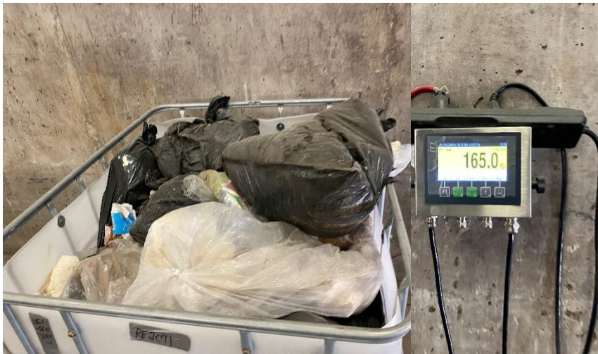
Photo 11: Waste audit sample collected from HRM collection area 2. Photo taken on May 19, 2022 during waste audit.