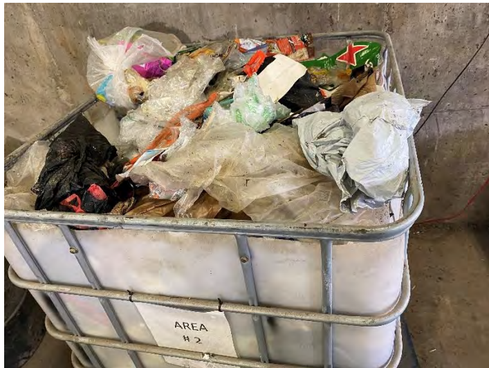
Photo 7: Waste sample collected from HRM collection Area 2 following sorting. Photo taken on August 30, 2022 during waste audit.