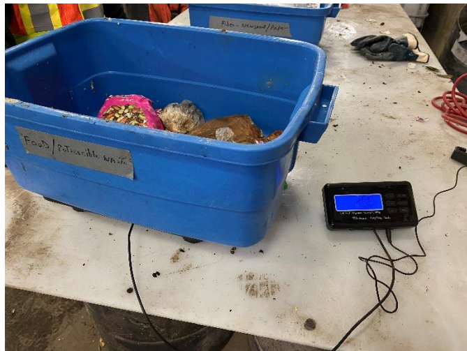
Photo 19: Food waste bin sorted from HRM collection area 3. Photo taken May 19, 2022 during waste audit.