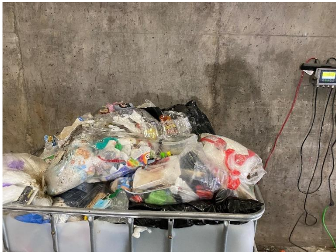
Photo 71: Garbage/Residue bin sorted from HRM collection area 8. Photo taken May 19, 2022 during waste audit.