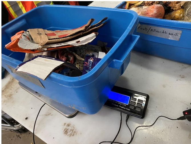
Photo 5: Fiber-OCC sorted from HRM collection area 1. Photo taken May 19, 2022 during waste audit.