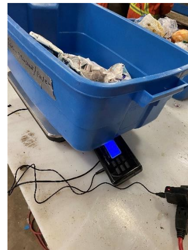
Photo 36: Fiber – Newspaper/ Paper bin sorted from HRM collection area 5. Photo taken May 19, 2022 during waste audit.