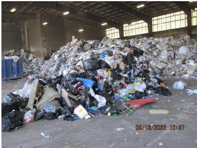
Photo 9: Waste pile from HRM collections area 2. Photo collected May 13, 2022