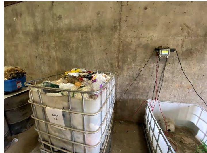
Photo 32: Waste sample from HRM collection Area 8 following sorting. Photo taken August 30, 2022 during waste audit.