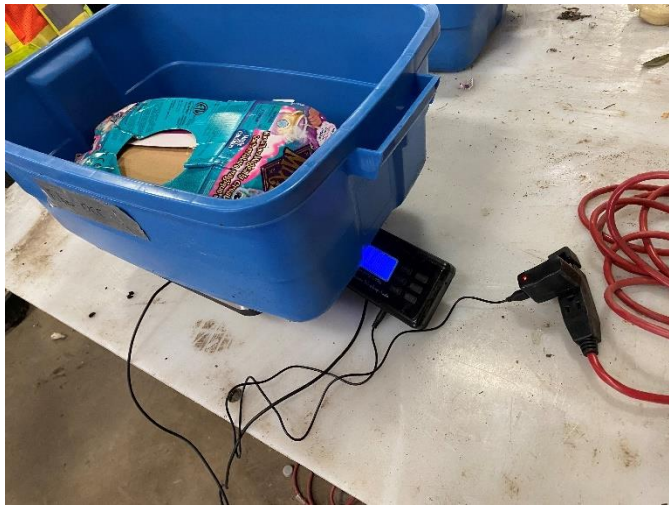
Photo 37: Fiber – OCC bin sorted from HRM collection area 5. Photo taken May 19, 2022 during waste audit.