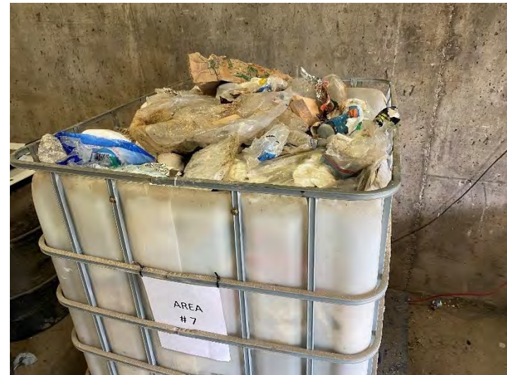
Photo 28: Waste sample from HRM collection Area 7 following sorting. Photo taken August 30, 2022 during waste audit.