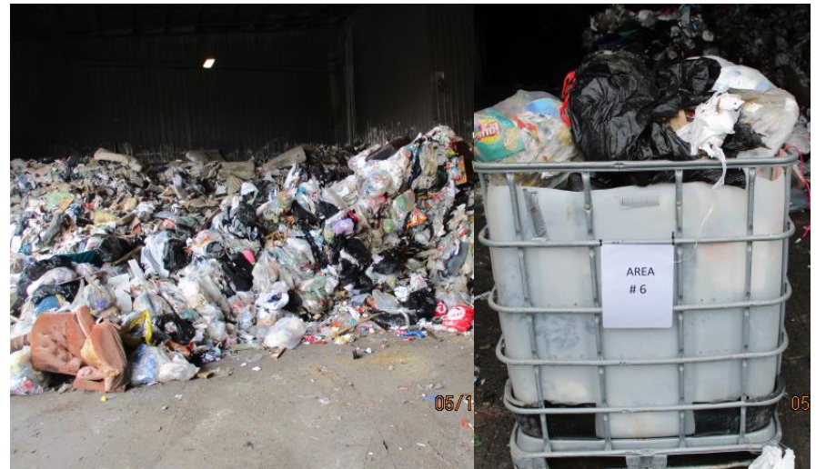
Photo 42: Waste audit sample from HRM collection area 6. Photo collected May 16, 2022.