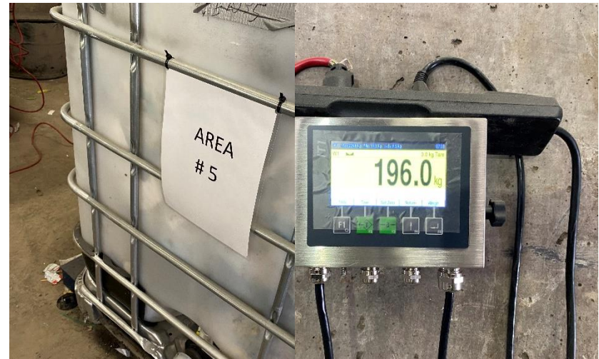
Photo 32: Weighing of waste audit sample collected from HRM collection area 5. Photo taken on May 19, 2022 during waste audit.