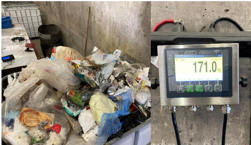
Photo 63: Garbage/Residue bin sorted from HRM collection area 8. Photo taken May 19, 2022 during waste audit.