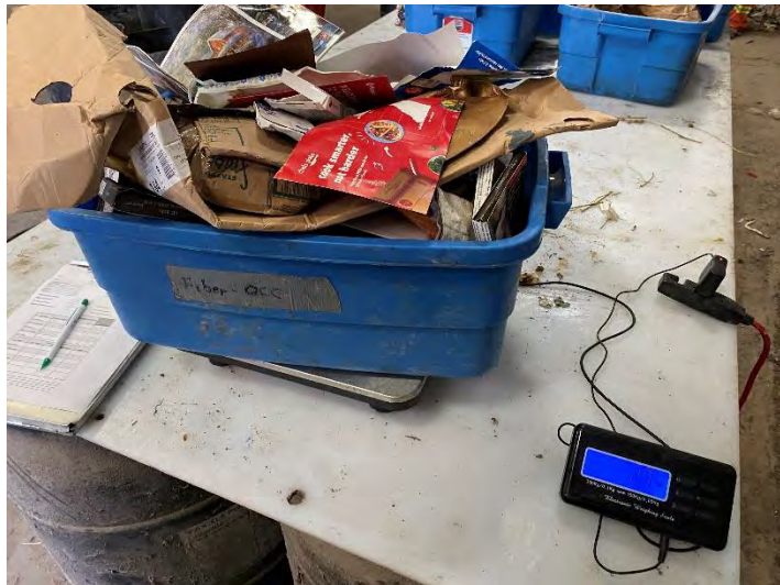
Photo 19: Fiber OCC waste bin separated from HRM collection Area 5. Photo taken August 30, 2022 during waste audit.