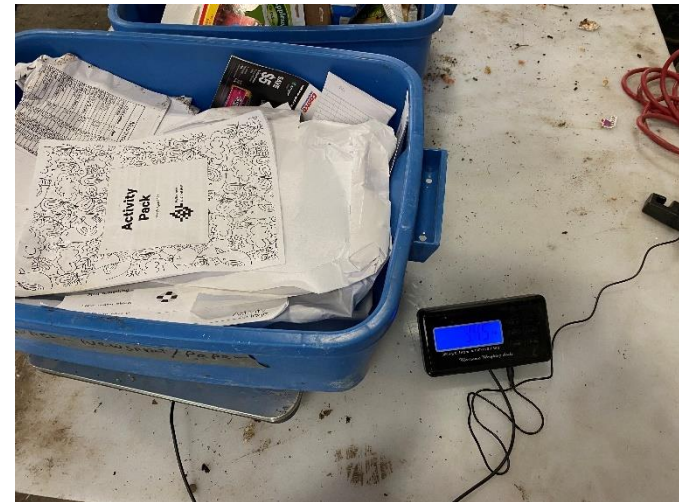
Photo 60: Fiber – Newspaper/ Paper bin sorted from HRM collection area 8. Photo taken May 19, 2022 during waste audit.