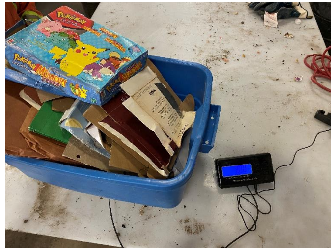
Photo 62: Fiber – OCC bin #2 sorted from HRM collection area 8. Photo taken May 19, 2022 during waste audit.