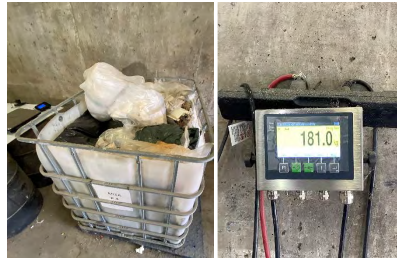
Photo 14: Waste audit sample from HRM collection Area 4. Photo collected August 30, 2022 during waste audit.