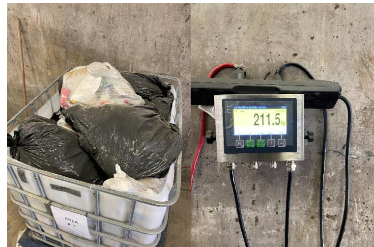
Photo 48: Weighing of waste audit sample collected from HRM collection area 7. Photo taken on May 19, 2022 during waste audit.