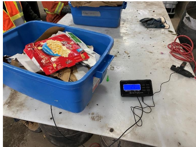
Photo 22: Fiber – OCC bin #2 sorted from HRM collection area 3. Photo taken May 19, 2022 during waste audit.