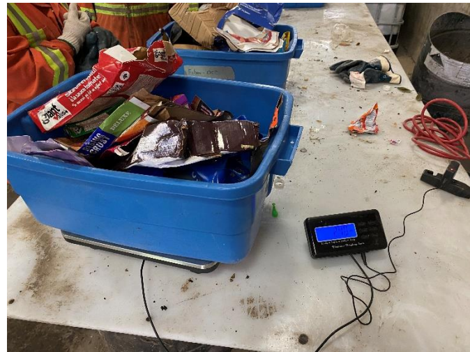
Photo 30: Fiber – OCC bin #2 sorted from HRM collection area 4. Photo taken May 19, 2022 during waste audit.