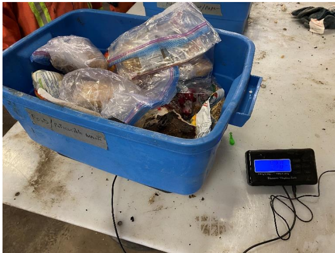
Photo 51: Food waste bin separated from HRM collection area 7. Photo taken May 19, 2022 during waste audit.