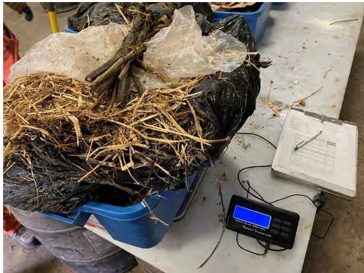
Photo 31: Yard waste bin separated from HRM collection Area 8. Photo taken August 30, 2022 during waste audit.