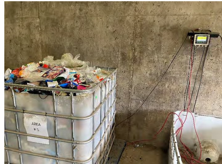
Photo 20: Waste sample from HRM collection Area 5 following sorting. Photo taken August 30, 2022 during waste audit.