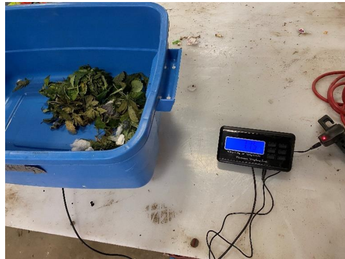
Photo 46: Yard waste bin sorted from HRM collection area 6. Photo taken May 19, 2022 during waste audit.