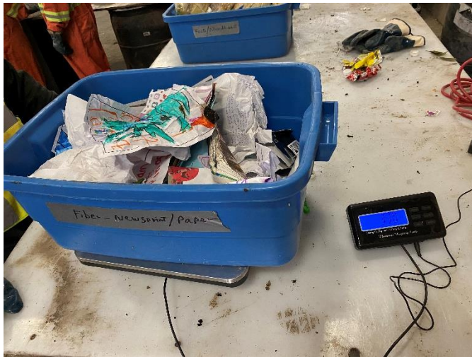
Photo 13: Fiber – Newspaper/ Paper bin sorted from HRM collection area 2. Photo taken May 19, 2022 during waste audit.