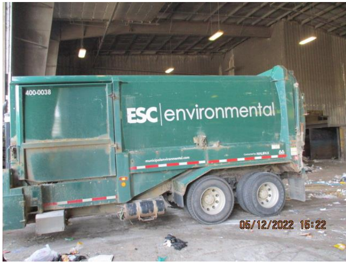
Photo 57: Waste collection vehicle unloading waste collected from HRM collection area 8. Photo taken on May 12, 2022.