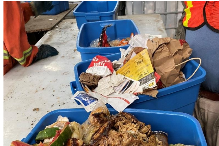
Photo 6: Fiber- Newspaper/Paper bin #1 sorted from HRM collection area 1. Photo taken May 19, 2022 during waste audit.