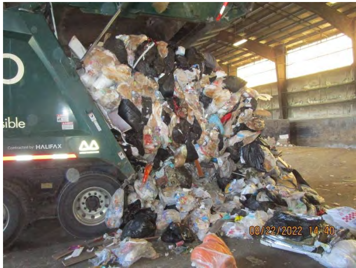
Photo 17: Waste collection vehicle unloading waste collected from HRM collection Area 5. Photo taken on August 22, 2022.