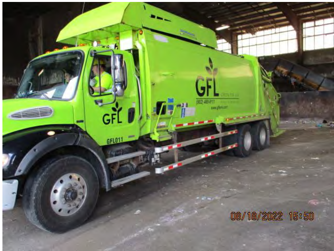
Photo 13: Waste collection vehicle unloading waste collected from HRM collection Area 4. Photo taken on August 18, 2022.