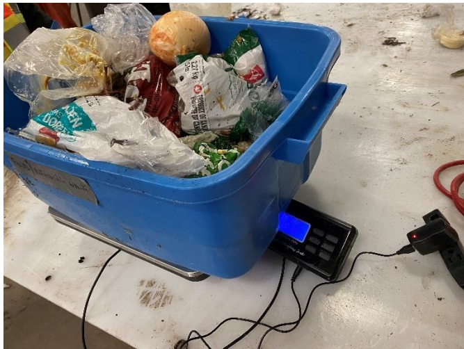
Photo 35: Food waste bin separated from HRM collection area 5. Photo taken May 19, 2022 during waste audit.