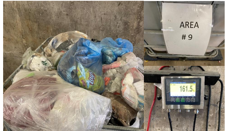
Photo 64: Weighing of waste audit sample collected from HRM collection area 9. Photo taken on May 19, 2022 during waste audit.