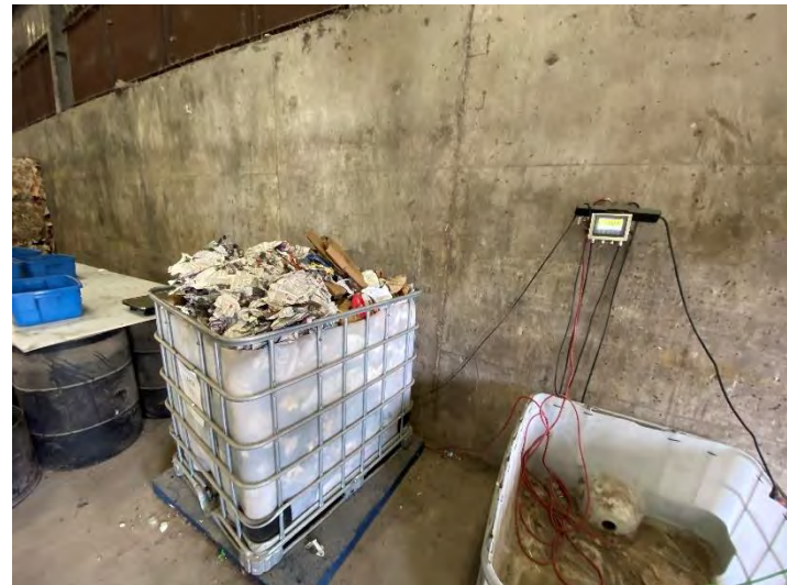
Photo 10: Waste audit sample from HRM collection Area 3. Photo collected August 30, 2022 during waste audit.