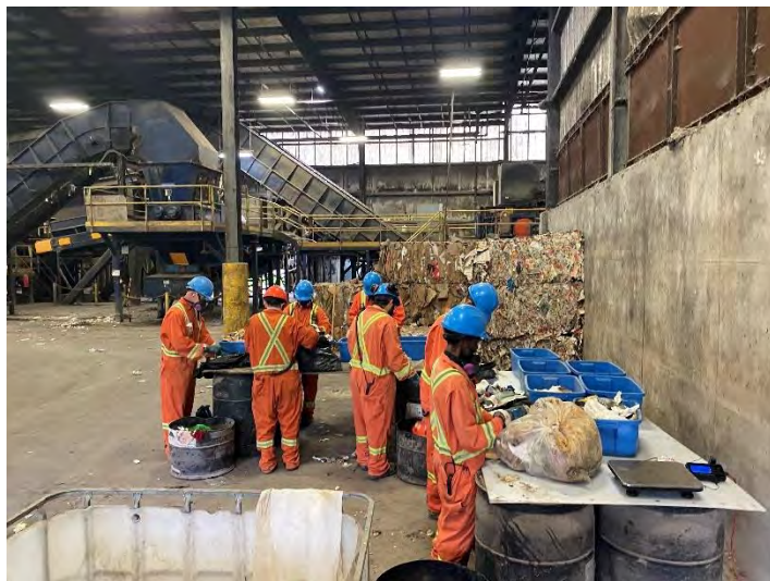
Photo 3: Sorting process of HRM collection Area 1. Photo taken August 30, 2022 during waste audit.