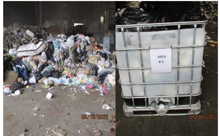
Photo 34: Waste audit sample from HRM collection area 5. Photo collected May 16, 2022.