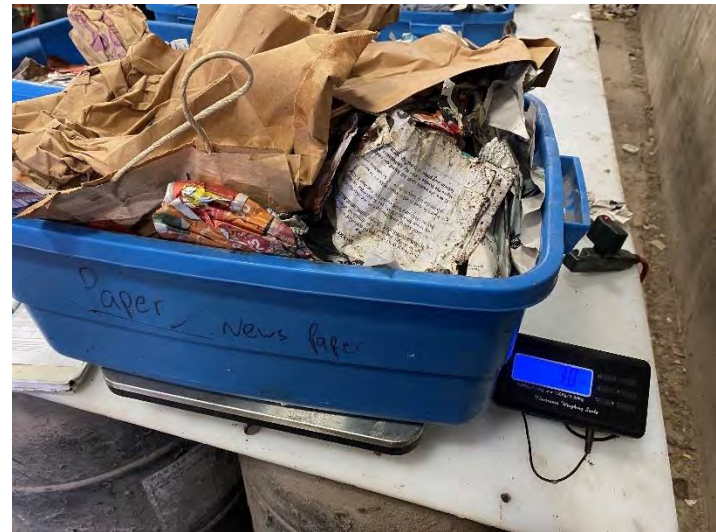
Photo 8: Newsprint/ paper bin sorted from HRM collection Area 2. Photo taken August 30, 2022 during waste audit.