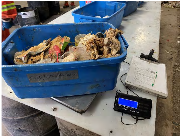
Photo 15: Food waste bin sorted from HRM collection Area 4. Photo taken August 30, 2022 during waste audit.