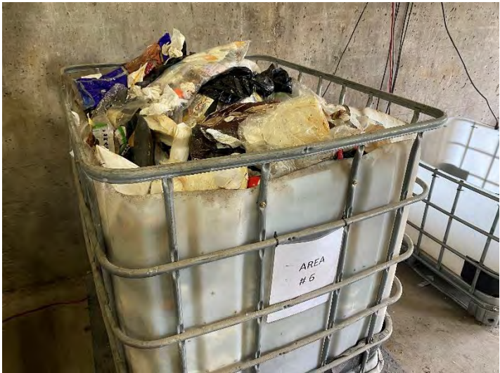
Photo 24: Waste sample from HRM collection Area 6 following sorting. Photo taken August 30, 2022 during waste audit.