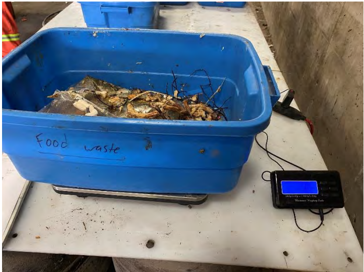
Photo 23: Food waste bin separated from HRM collection Area 6. Photo taken August 30, 2022 during waste audit.