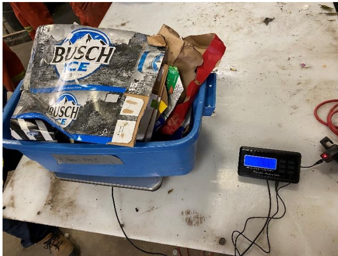
Photo 45: Fiber – OCC bin sorted from HRM collection area 6. Photo taken May 19, 2022 during waste audit.