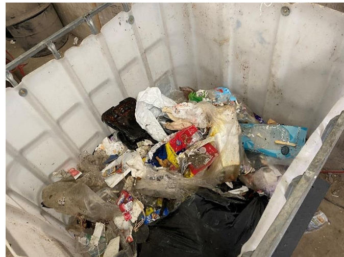
Photo 8: Garbage/Residue sorted from HRM collection area 1. Photo taken May 19, 2022 during waste audit.