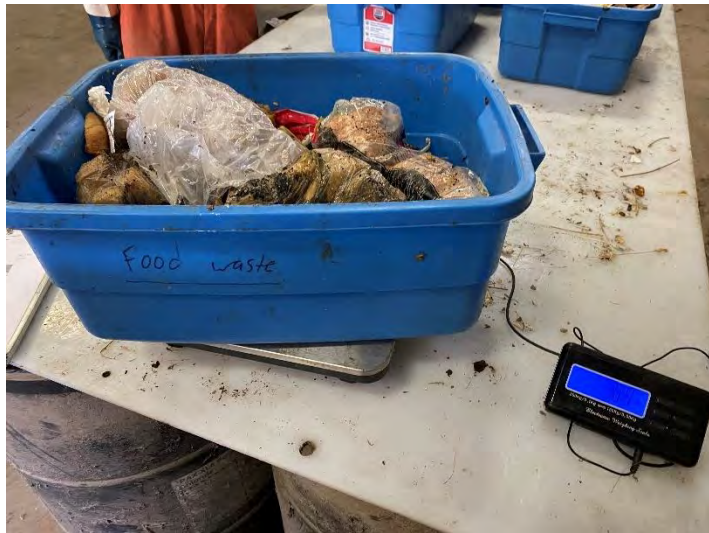
Photo 35: Food waste bin separated from HRM collection Area 9 (Condos). Photo taken August 30, 2022 during waste audit.