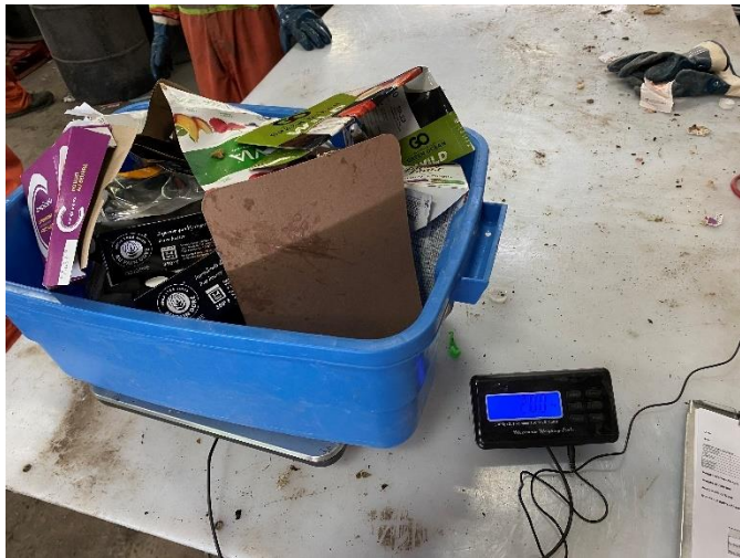
Photo 69: Fiber – OCC bin sorted from HRM collection area 9. Photo taken May 19, 2022 during waste audit.