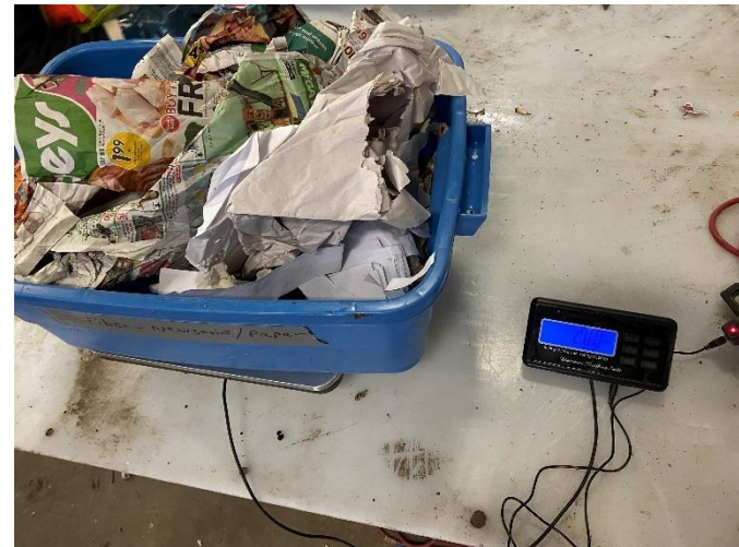
Photo 44: Fiber – Newspaper/ Paper bin sorted from HRM collection area 6. Photo taken May 19, 2022 during waste audit.