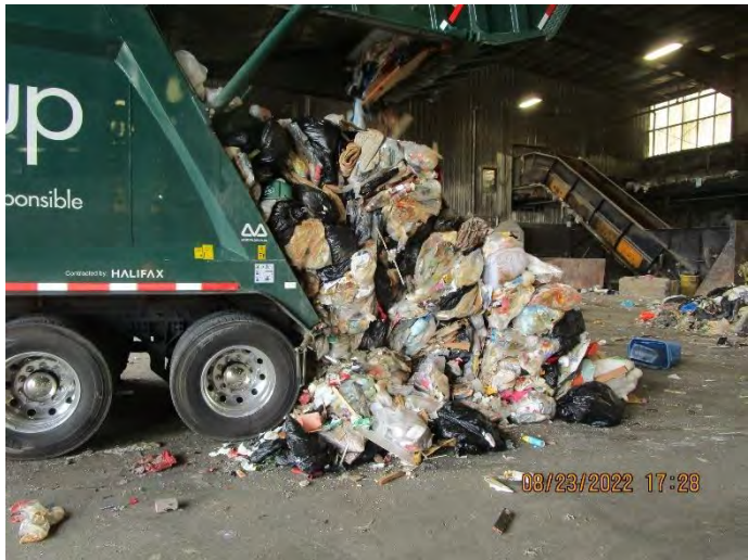
Photo 21: Waste collection vehicle unloading waste collected from HRM collection Area 6. Photo taken on August 23, 2022.