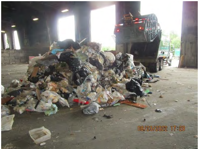
Photo 22: Waste pile from HRM collection Area 6. Photo collected August 23, 2022.