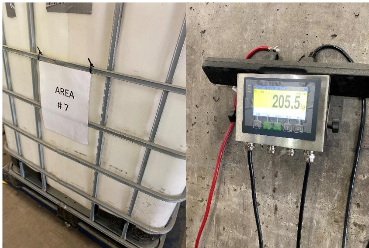
Photo 55: Garbage/Residue bin sorted from HRM collection area 7. Photo taken May 19, 2022 during waste audit.