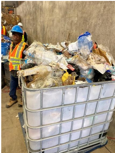
Photo 31: Weighing of Garbage/Residue bin sorted from HRM collection area 4. Photo taken May 19, 2022 during waste audit.