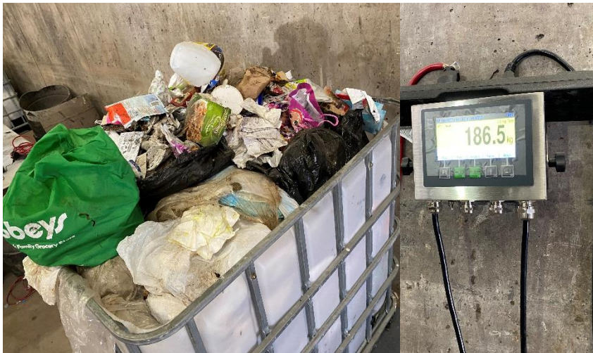
Photo 39: Garbage/Residue bin sorted from HRM collection area 5. Photo taken May 19, 2022 during waste audit.