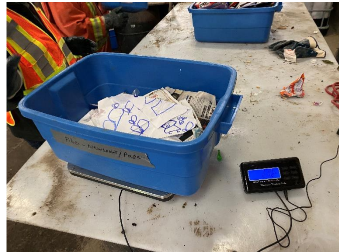
Photo 28: Fiber – Newspaper/ Paper bin sorted from HRM collection area 4. Photo taken May 19, 2022 during waste audit.