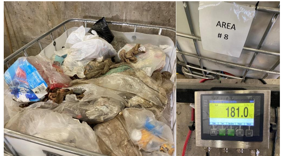
Photo 56: Weighing of waste audit sample collected from HRM collection area 8. Photo taken on May 19, 2022 during waste audit.