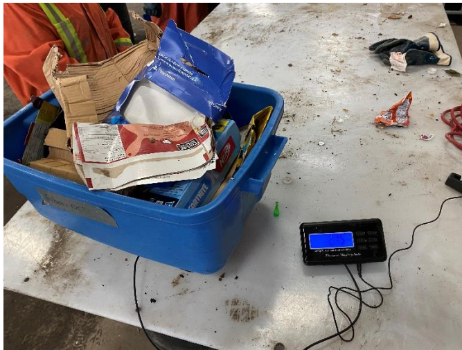
Photo 29: Fiber – OCC bin #1 sorted from HRM collection area 4. Photo taken May 19, 2022 during waste audit.