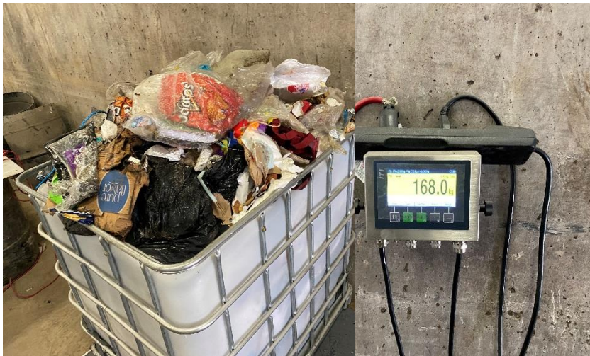
Photo 47: Garbage/Residue bin sorted from HRM collection area 6. Photo taken May 19, 2022 during waste audit.