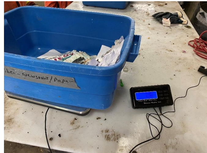
Photo 52: Fiber – Newspaper/ Paper bin sorted from HRM collection area 7. Photo taken May 19, 2022 during waste audit.