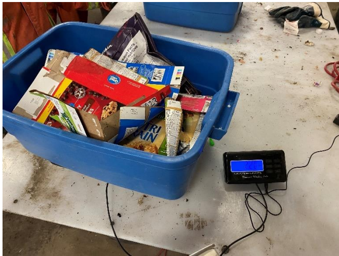
Photo 61: Fiber – OCC bin #1 sorted from HRM collection area 8. Photo taken May 19, 2022 during waste audit.