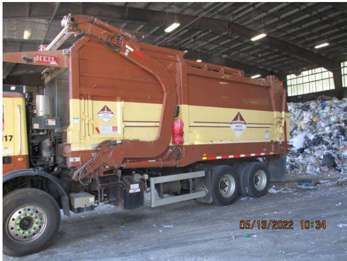
Photo 65: Waste collection vehicle unloading waste collected from HRM collection area 9. Photo taken on May 13, 2022.