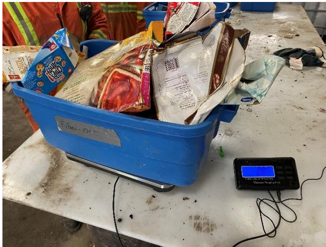
Photo 53: Fiber – OCC bin #1 sorted from HRM collection area 7. Photo taken May 19, 2022 during waste audit.