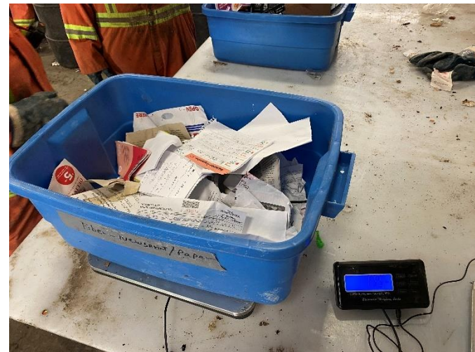
Photo 68: Fiber – Newspaper/ Paper bin sorted from HRM collection area 9. Photo taken May 19, 2022 during waste audit.