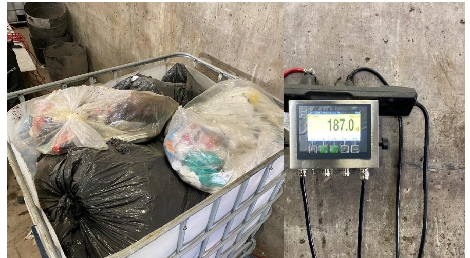
Photo 16: Waste audit sample collected from HRM collection area 3. Photo taken on May 19, 2022 during waste audit.