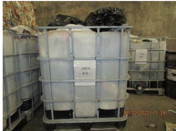
Photo 34: Waste audit sample from HRM collection Area 9 (Condos). Photo collected August 22, 2022.