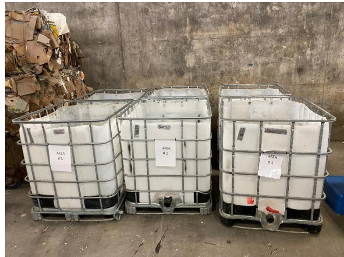
Photo 72: Empty waste audit collection bin. Photo taken May 19, 2022 after successful completion of waste audit waste audit.