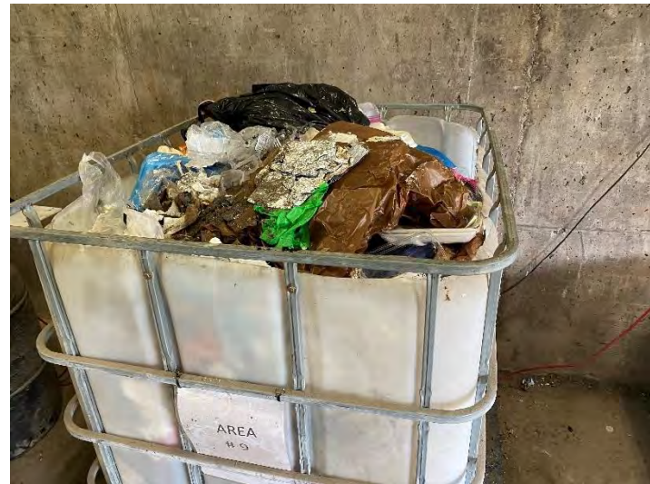
Photo 36: Waste sample from HRM collection Area 9 (Condos) following sorting. Photo taken August 30, 2022 during waste audit.