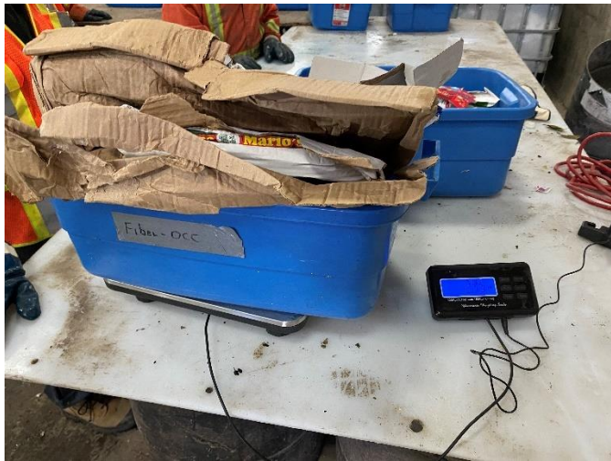
Photo 21: Fiber – OCC bin #1 sorted from HRM collection area 3. Photo taken May 19, 2022 during waste audit.