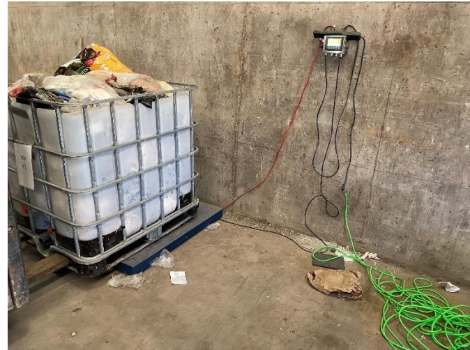
Photo 2: Waste audit sample collected from HRM collection area 1. Photo taken on May 19, 2022 during waste audit.