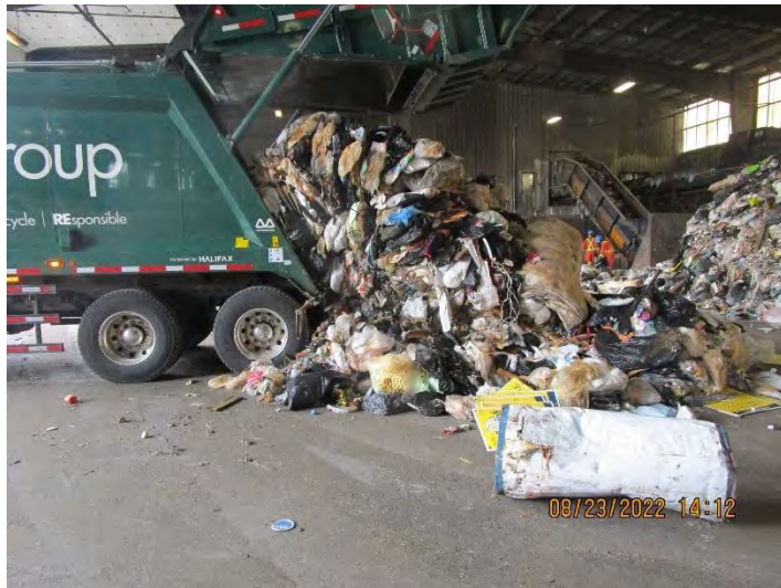
Photo 1: Waste collection vehicle unloading waste collected from HRM collection Area 1. Photo taken on August 23, 2022.