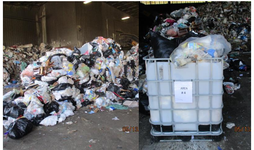
Photo 26: Waste audit sample from HRM collection area 4. Photo collected May 13, 2022.