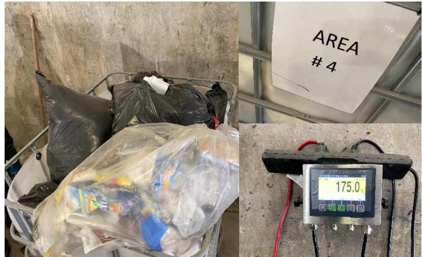
Photo 24: Waste audit sample collected from HRM collection area 4. Photo taken on May 19, 2022 during waste audit.