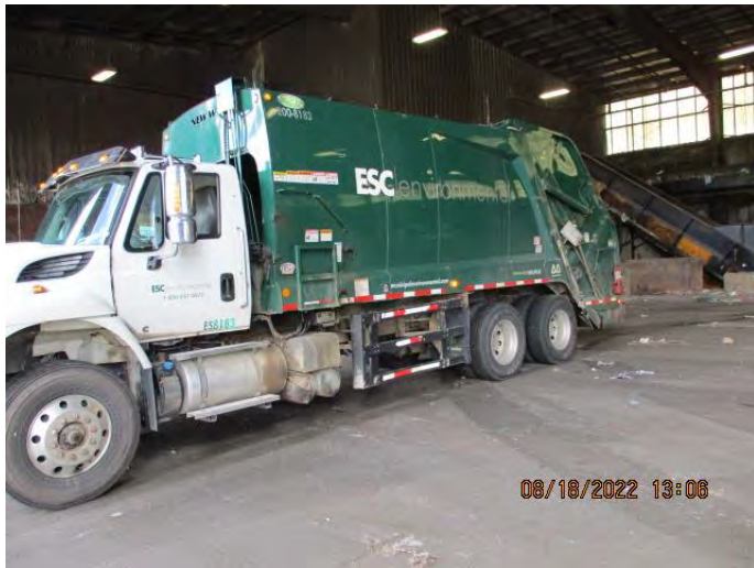
Photo 29: Waste collection vehicle unloading waste collected from HRM collection Area 8. Photo taken on August 28, 2022.