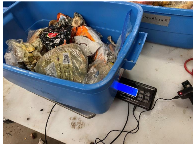
Photo 4: Food waste bin #2 sorted from HRM collection area 1. Photo taken May 19, 2022 during waste audit.