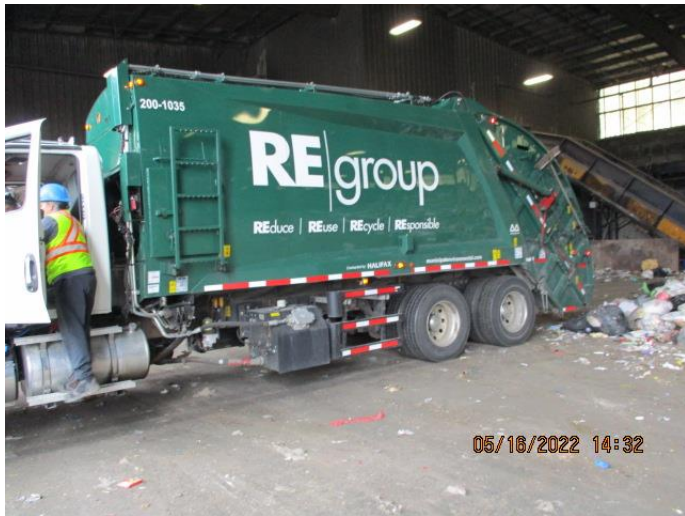
Photo 33: Waste collection vehicle unloading waste collected from HRM collection area 5. Photo taken on May 16, 2022.