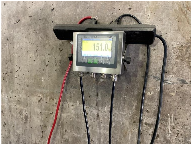
Photo 15: Weighing of Garbage/Residue bin sorted from HRM collection area 2. Photo taken May 19, 2022 during waste audit.