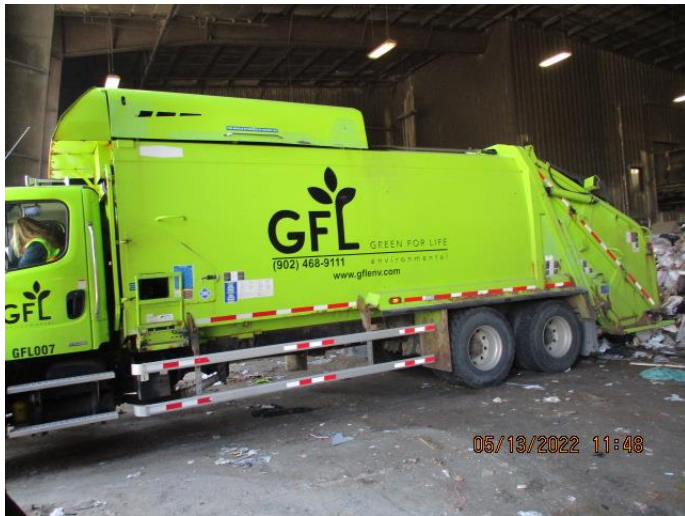
Photo 25: Waste collection vehicle unloading waste collected from HRM collection area 4. Photo taken on May 13, 2022.