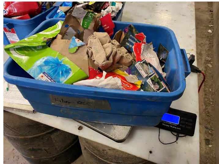
Photo 12: Fiber OCC sorted from HRM collection Area 3. Photo taken August 30, 2022 during waste audit.