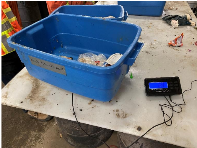
Photo 27: Food waste bin sorted from HRM collection area 4. Photo taken May 19, 2022 during waste audit.