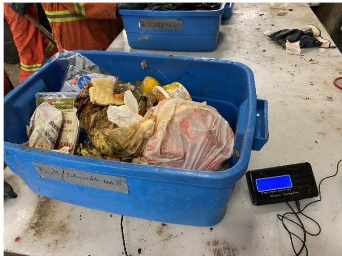
Photo 67: Food waste bin separated from HRM collection area 9. Photo taken May 19, 2022 during waste audit.