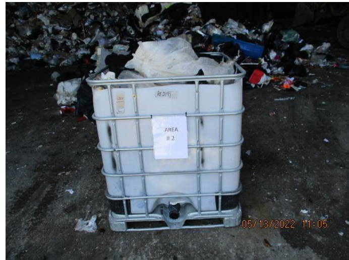
Photo 10: Waste audit sample from HRM collection area 2. Photo collected May 13, 2022.