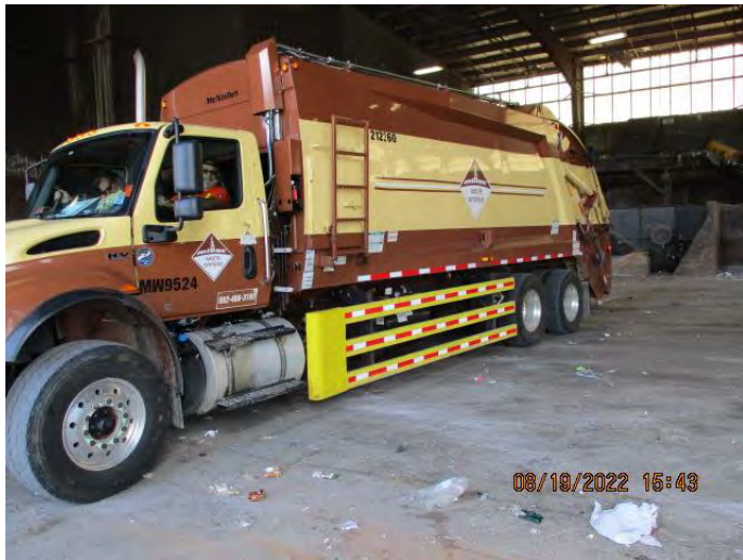
Photo 25: Waste collection vehicle unloading waste collected from HRM collection Area 7. Photo taken on August 19, 2022.