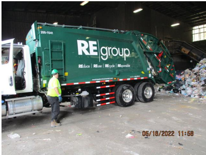
Photo 41: Waste collection vehicle unloading waste collected from HRM collection area 6. Photo taken on May 16, 2022.