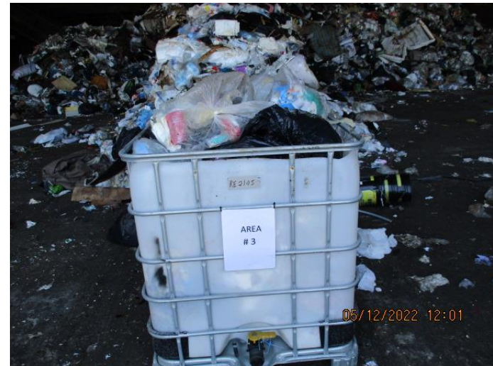
Photo 18: Waste audit sample from HRM collection area 3. Photo collected May 12, 2022.