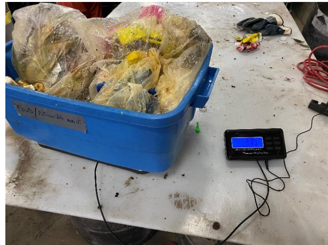
Photo 12: Food waste bin sorted from HRM collection area 2. Photo taken May 19, 2022 during waste audit.