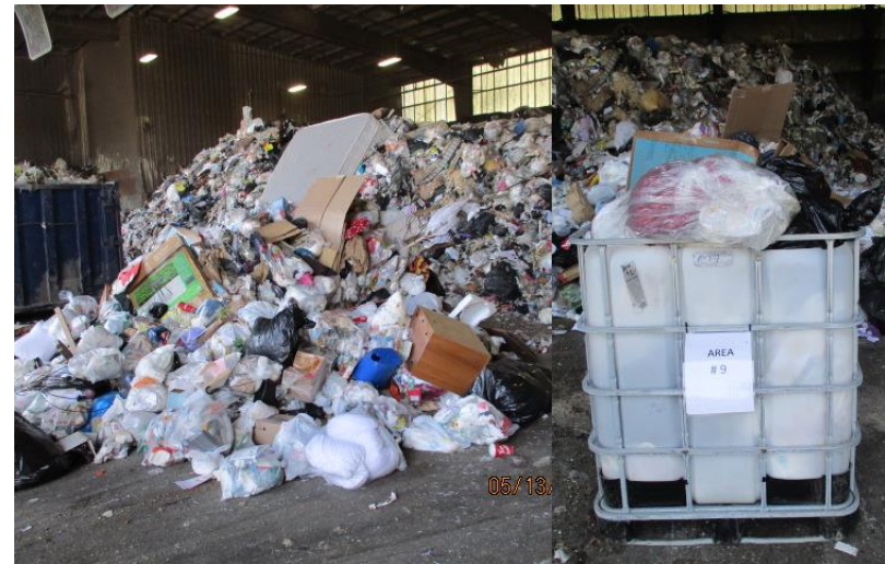
Photo 66: Waste audit sample from HRM collection area 9. Photo collected May 13, 2022.