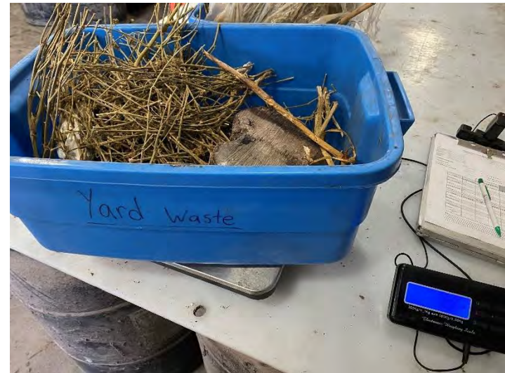
Photo 16: Yard waste bin sorted from HRM collection Area 4. Photo taken August 30, 2022 during waste audit.