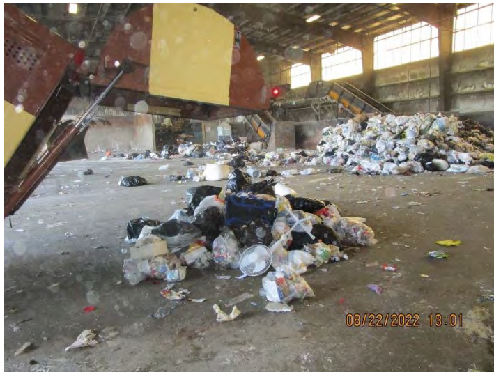
Photo 33: Waste collection vehicle unloading waste collected from HRM collection Area 9 (Condos). Photo taken on August 22, 2022.