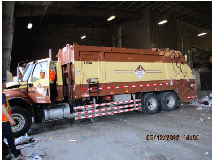
Photo 49: Waste collection vehicle unloading waste collected from HRM collection area 7. Photo taken on May 12, 2022.