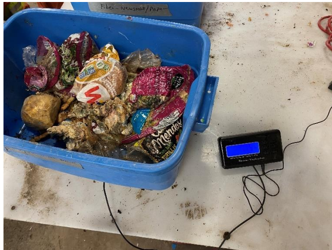
Photo 59: Food waste bin separated from HRM collection area 8. Photo taken May 19, 2022 during waste audit.