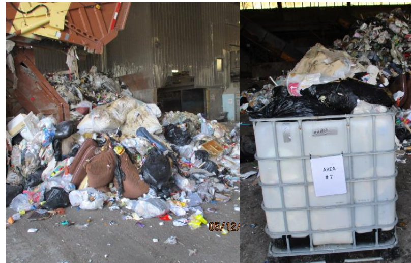
Photo 50: Waste audit sample from HRM collection area 7. Photo collected May 12, 2022.