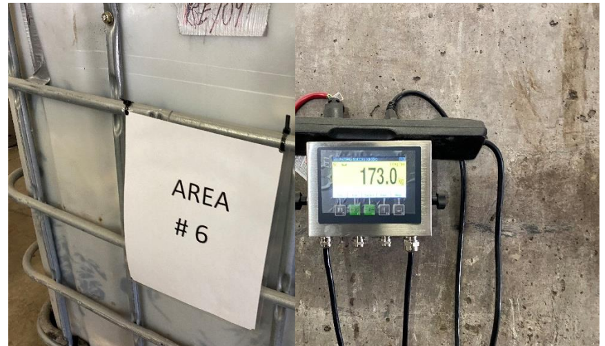
Photo 40: Weighing of waste audit sample collected from HRM collection area 6. Photo taken on May 19, 2022 during waste audit.