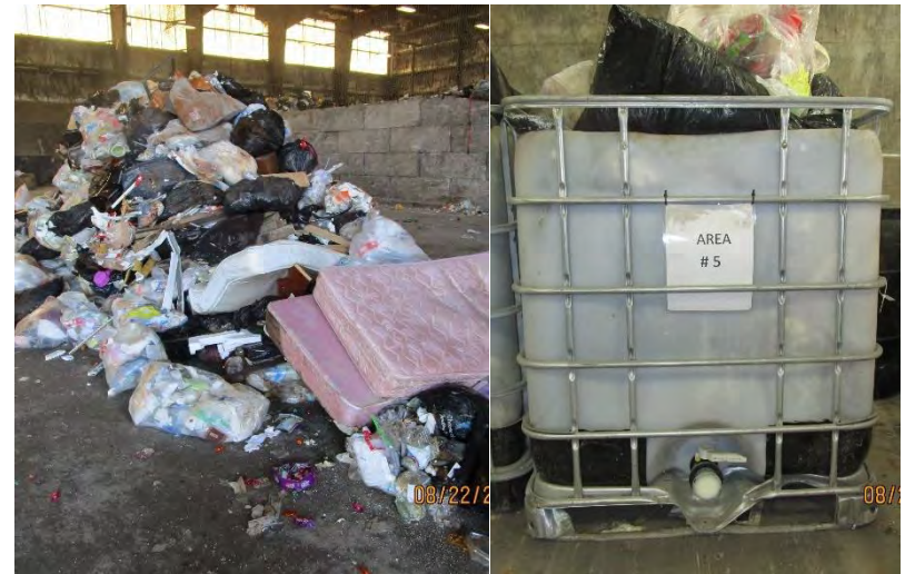
Photo 18: Waste audit sample from HRM collection Area 5. Photo collected August 22, 2022.