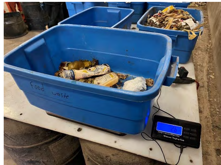
Photo 4: Food waste bin sorted from HRM collection Area 1. Photo taken August 30, 2022 during waste audit.