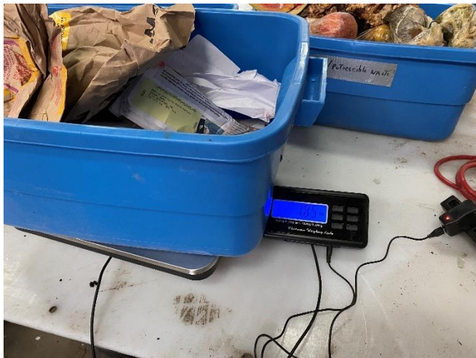
Photo 7: Fiber- Newspaper/Paper bin #2 sorted from HRM collection area 1. Photo taken May 19, 2022 during waste audit.