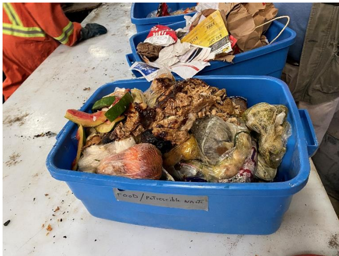
Photo 3: Food Waste bin #1 sorted from HRM collection area 1. Photo taken May 19, 2022 during waste audit.