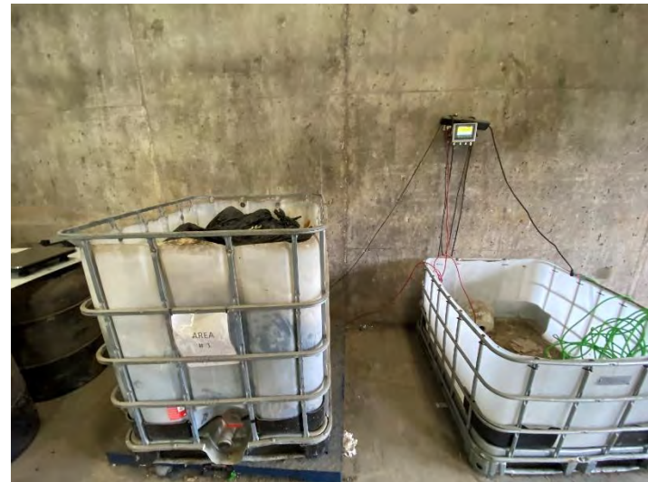
Photo 2: Waste audit sample collected from HRM collection Area 1. Photo taken on August 30, 2022 during waste audit.