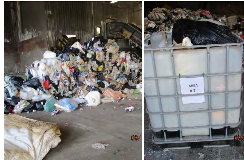
Photo 26: Waste audit sample from HRM collection Area 7. Photo collected August 19, 2022.