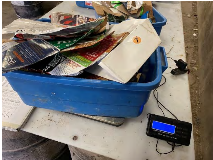
Photo 27: Fiber OCC bin separated from HRM collection Area 7. Photo taken August 30, 2022 during waste audit.