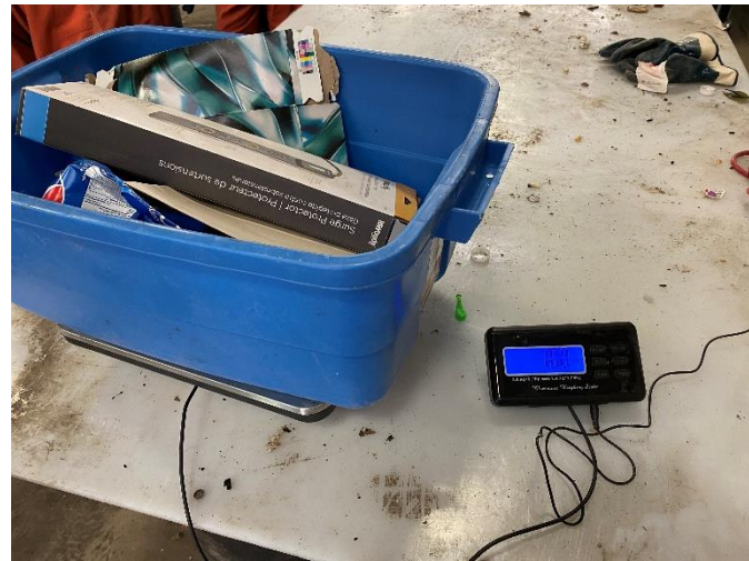
Photo 54: Fiber – OCC bin #2 sorted from HRM collection area 7. Photo taken May 19, 2022 during waste audit.