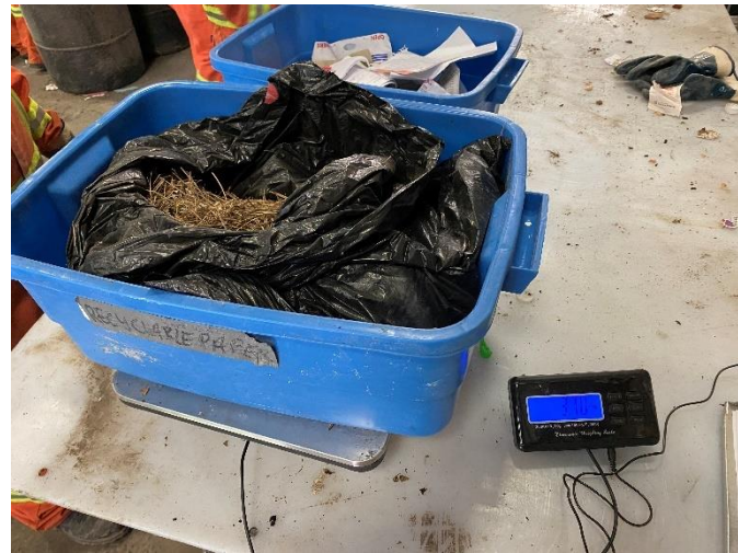
Photo 70: Yard waste bin sorted from HRM collection area 9. Photo taken May 19, 2022 during waste audit.