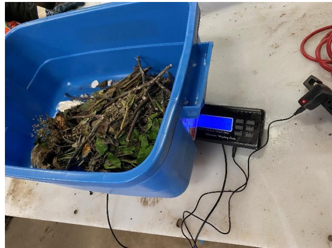
Photo 38: Yard waste bin sorted from HRM collection area 5. Photo taken May 19, 2022 during waste audit.