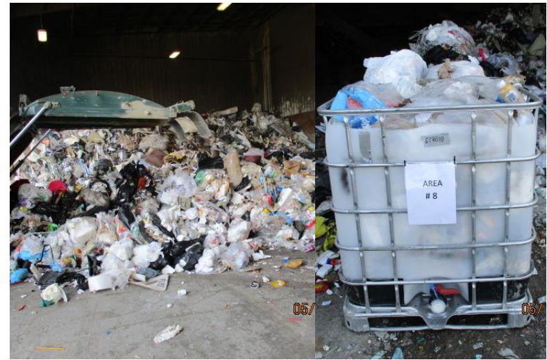
Photo 58: Waste audit sample from HRM collection area 8. Photo collected May 12, 2022.