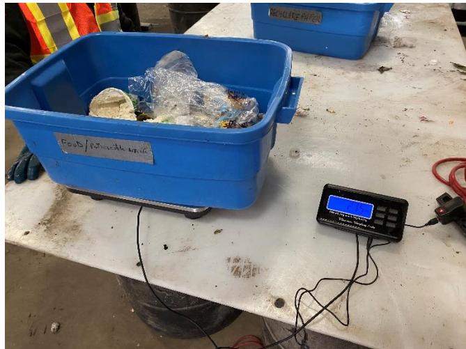
Photo 43: Food waste bin separated from HRM collection area 6. Photo taken May 19, 2022 during waste audit.