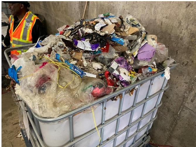
Photo 23: Weighing of Garbage/Residue bin sorted from HRM collection area 3. Photo taken May 19, 2022 during waste audit.