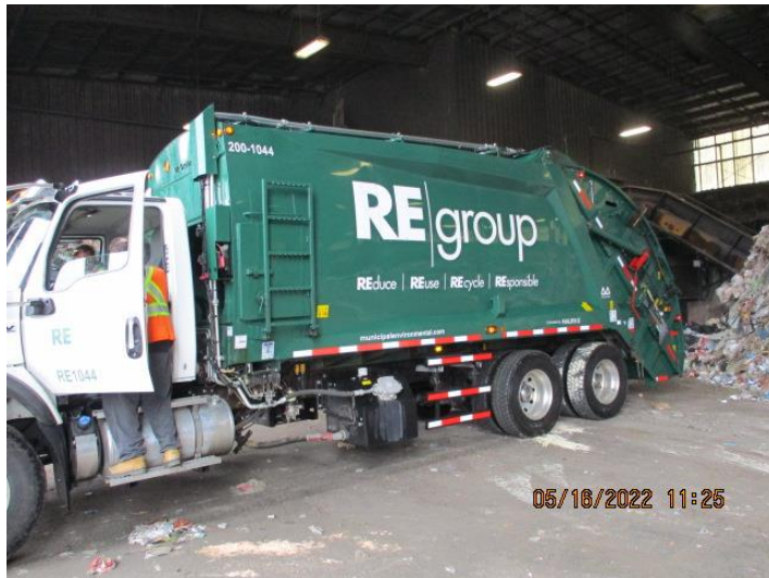
Photo 1: Waste collection vehicle unloading waste collected from HRM collection area 1. Photo taken on May 16, 2022.