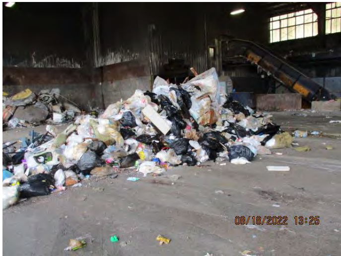
Photo 5: Waste pile from HRM collections Area 2. Photo collected August 18, 2022