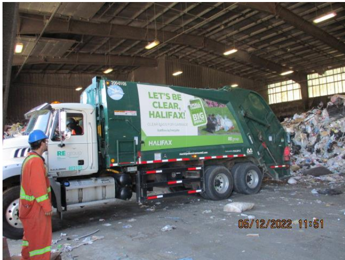
Photo 17: Waste collection vehicle unloading waste collected from HRM collection area 3. Photo taken on May 12, 2022.