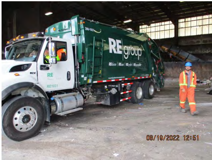
Photo 9: Waste collection vehicle unloading waste collected from HRM collection Area 3. Photo taken on August 19, 2022.