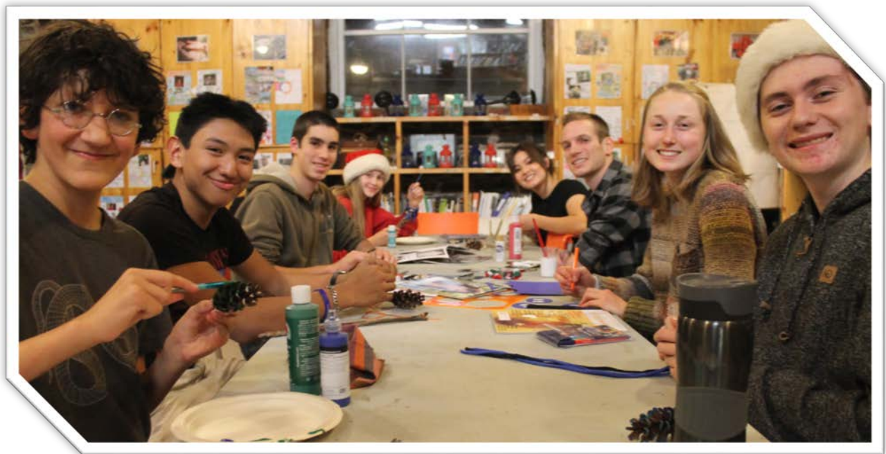
Youth at the Adventure Earth Centre partake in arts and crafts

The information presented in this report provides an overview of the services and programs the Municipality offered to youth over fall and winter 2016-2017.