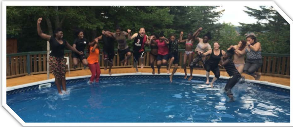
Regional Girls United (GU) Group after a white-water rafting trip

Girls United is an outreach program of the Youth Advocate Program. It receives an annual grant of $12,000 from the NS Department of Justice and is supported by staff of the Youth Advocate Program, as well as staff from Recreation Programming. Girls United focuses on girls, ages 12 -14 years old, who are either involved in the Youth Advocate Program or girls outside this program. The strategy is to use a wide range of activities and strong positive relationships to support girls who have experienced or have been exposed to gender specific risks. Program modules are delivered using a variety of methods: including outdoor adventure based pursuits; field trips; guest speakers; recreation; sport; health and wellness based activities.