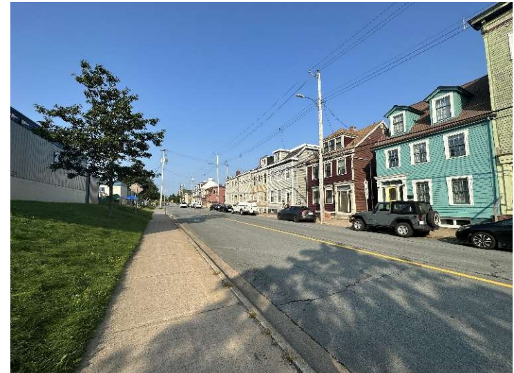
Cogswell Street facing west from 5561 Cogswell Street (September 2023)