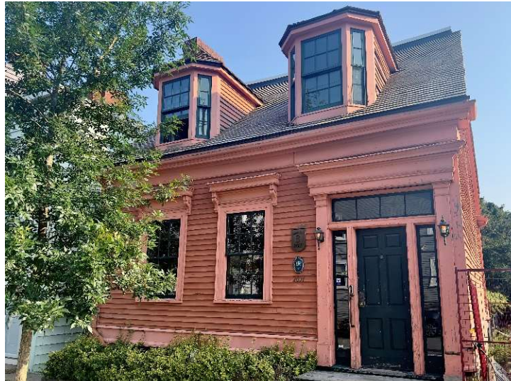
Registered heritage property at 2031 Creighton Street, example of Scottish vernacular house (September 2023)