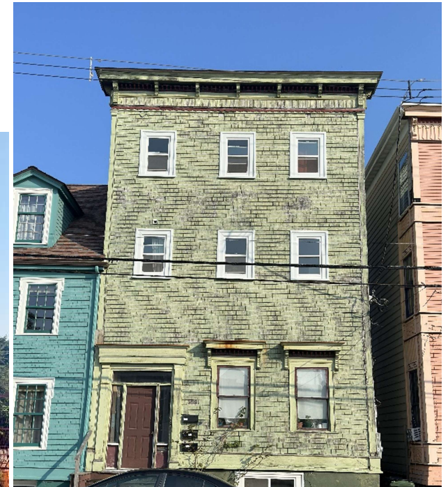
5561 Cogswell Street (September 2023)