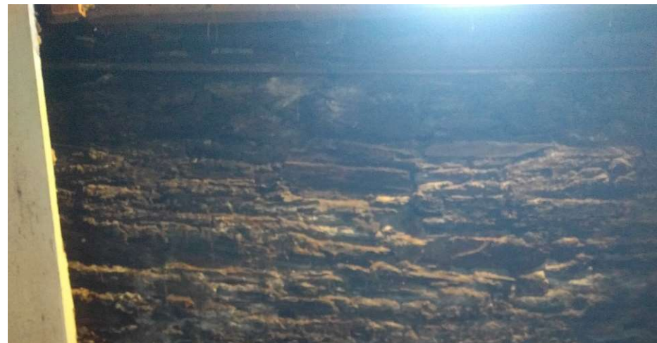
Original rubblestone foundation as visible from interior