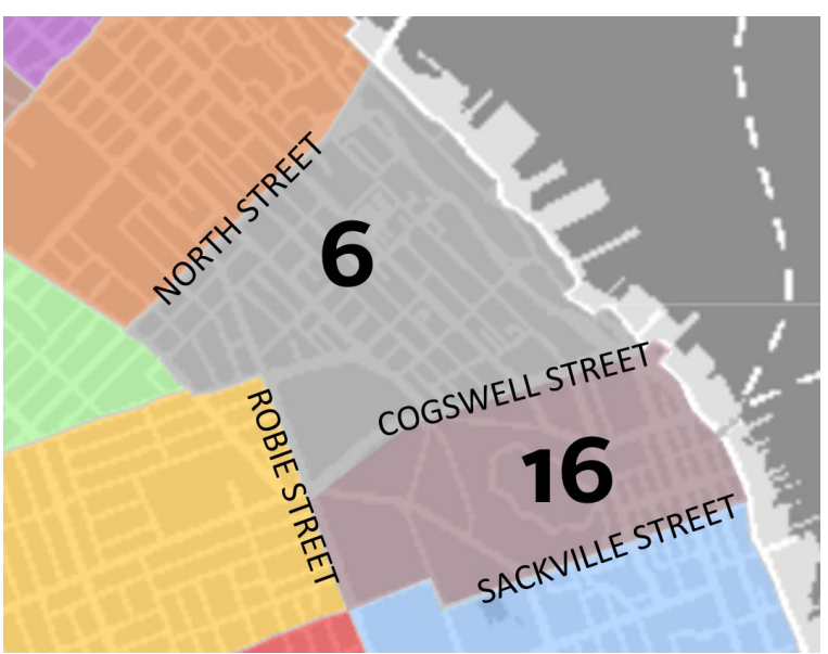
Permit Zones 6 and 16. Prior to May 2023, both areas were part of Zone 6.

Zone 16 was created, encompassing the commercial area of the previous Zone 6. The intention was to set commuter pricing to be lower in the primarily residential areas in Zone 6, and to price Zone 16 at a higher rate, in line with other similar commercial/institutional areas. An oversight in the previous pricing table change led to commuter pricing not being amended at that time for the streets now in Zone 16. To correct the oversight from the previous change, staff recommend increasing the cost of commuter permits in Zone 16 from $55 to $70 per month (plus HST) to better reflect the demand in the zone.