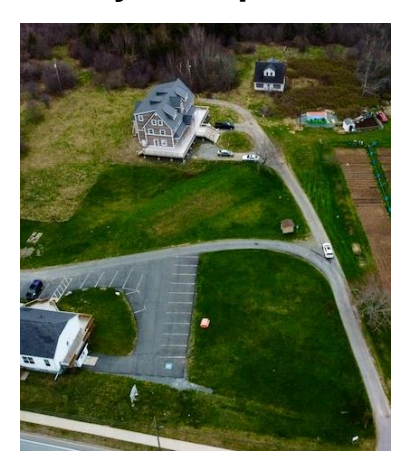
Akoma 1018 Main Street, Dartmouth Near Completion

North End Health Community Association- 2218 Maitland St Halifax Fully Occupied