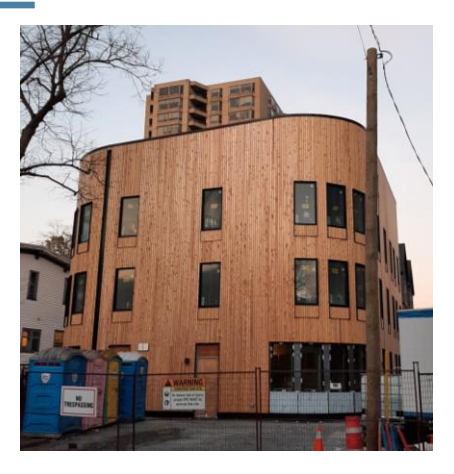
Mi'kmaq Native Friendship Centre 5853 College St Halifax Near Completion

Affordable Housing Association of Nova Scotia 101 Yorkshire Ave, Dartmouth Partially Occupied