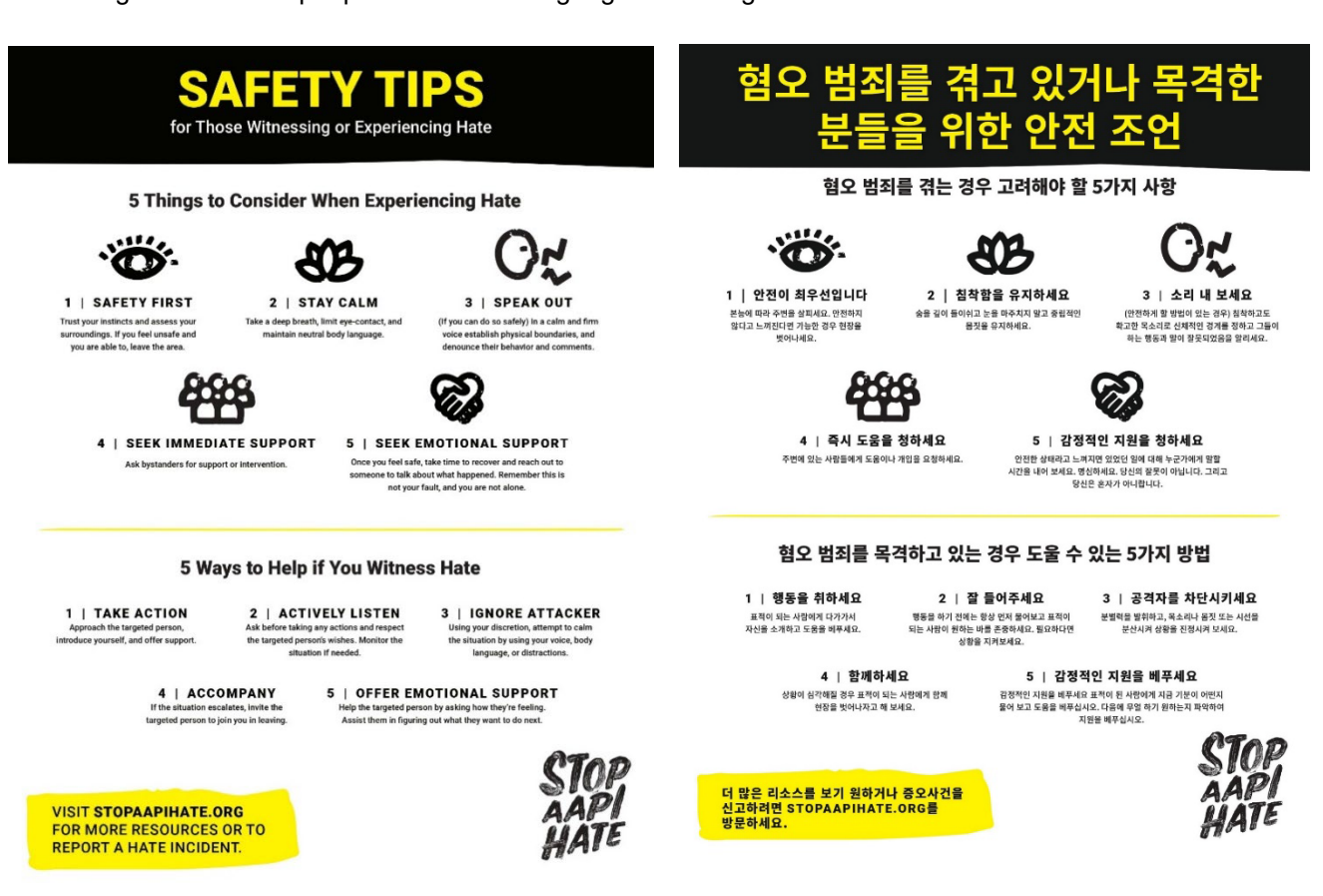
Figure 2: Examples of safety tip posters for those witnessing or experiencing hate provided by Stop AAPI Hate in English and Korean.

Providing materials and information in multiple languages—particularly the languages spoken by those most impacted by hate-motivated incidents and other languages spoken in the location where the resources are being shared—is a best practice and critically important in supporting the safety of women, non-binary and gender diverse people whose first language is not English.