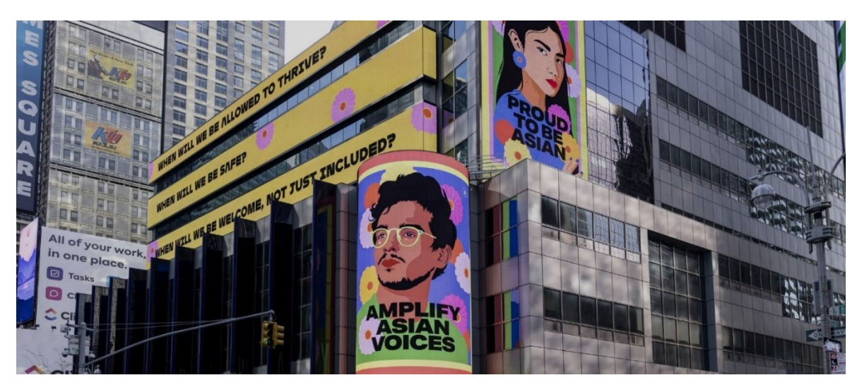
Figure 4: Phingbodhipakkiya's work displayed in Times Square, NYC.

The campaigns are titled "I Still Believe in Our City" and "We Are More" and have been displayed in Times Square and other cities across the U.S.