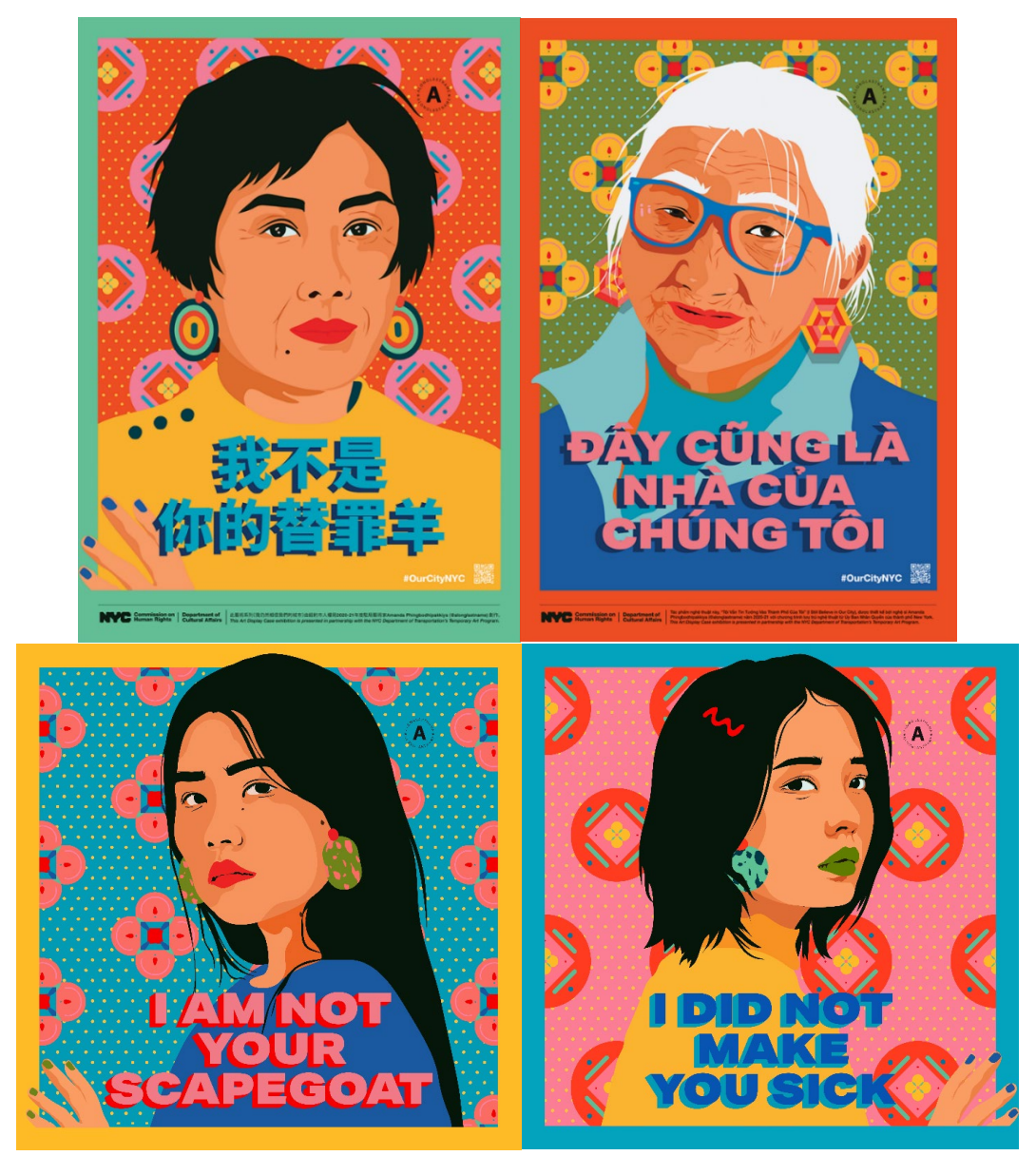
Figure 5: Phingbodhipakkiya's "I Still Believe in Our City" and "We Are More" art series. The text in the top left image is Chinese (traditional), the top right is Vietnamese and the bottom two are English.

There are many other resources that can inform the Municipality's work to support the safety of Asian women, non-binary, and gender-diverse residents. Some of these include: