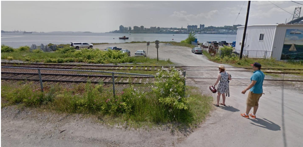
Google Street View Image of Site