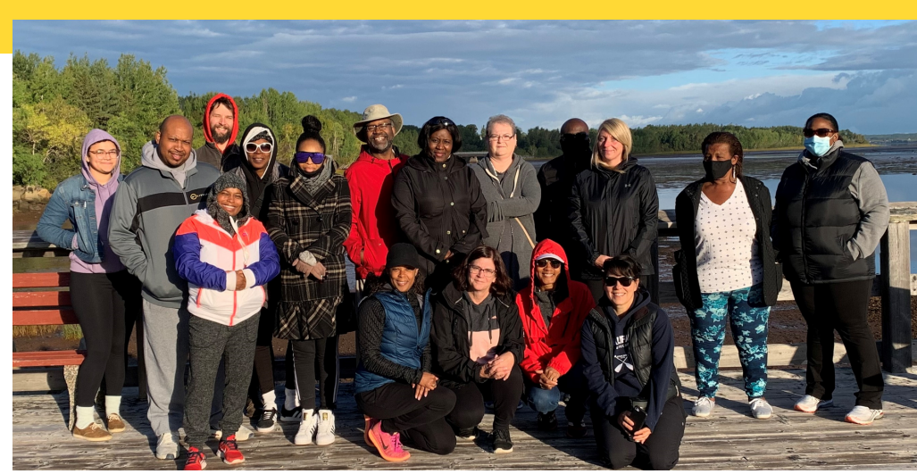
Working Cross Culturally Retreat in Tatamagouche

Community Mobilizations Teams (CMTs) in HRM have been active since 2017, stemming from community recommendations within the 2016 Mayors Round Table on Violence. The first CMT was established in Mulgrave Park and has grown to include the communities of Central North Halifax, and North and East Preston. Public Safety Office staff realize that each community operates in different ways and that relationships are unique and take time to build trust. CMTs build on community strengths to develop and implement practical solutions that increase safety and empower residents and community-based organizations. An essential step in establishing an effective crisis response is ensuring the community has the necessary capacity to support itself.