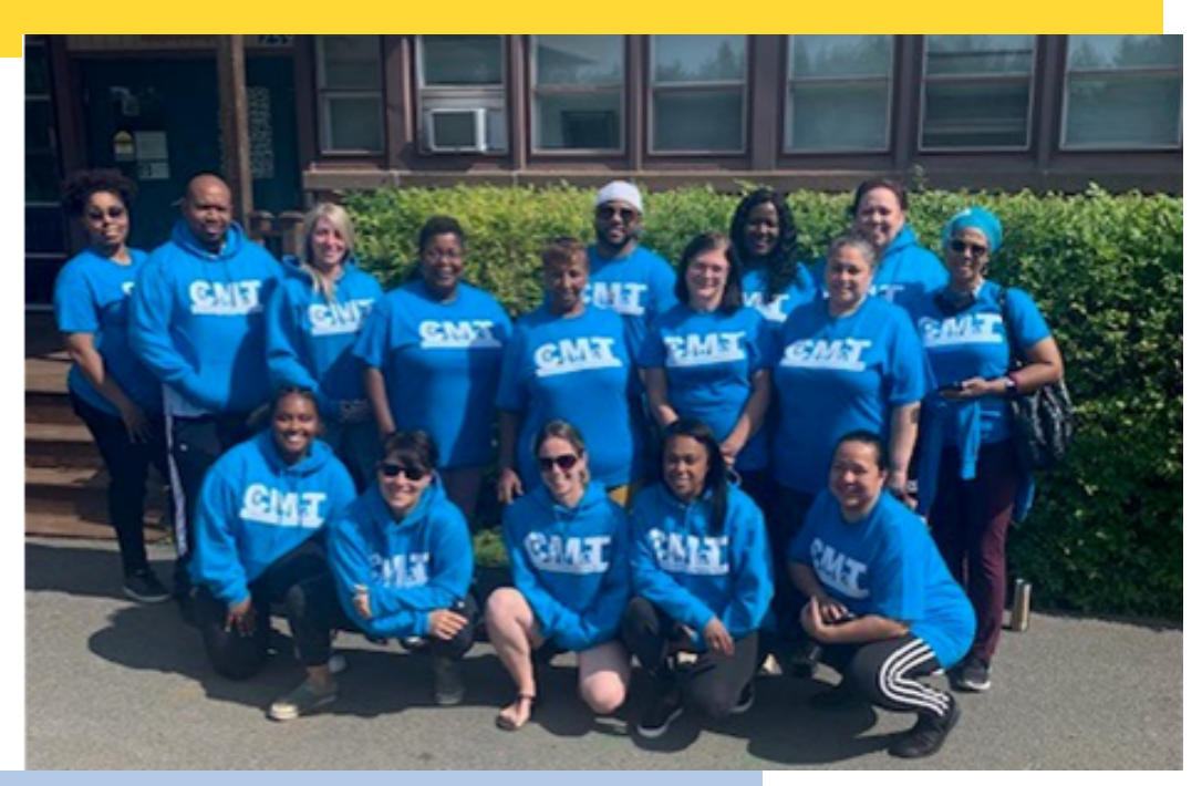
ASIST Participants at Tatamagouche Centre

Outcomes: Participants are trained in ASIST. Members were able to bond through story sharing.