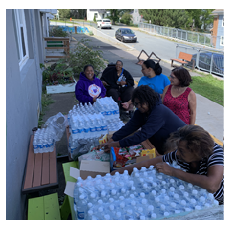
CMT members in Mulgrave Park handing out food in community after Hurricane Dorian