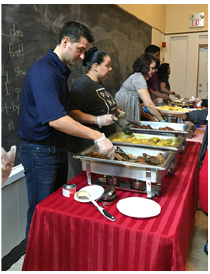
CMT members in Mulgrave Park handing out food in community at a celebration of life event.