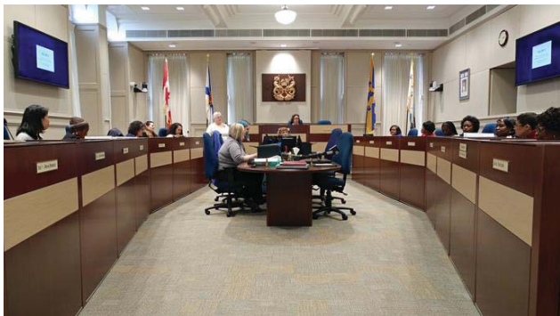
Participants at the Council Chambers, April 2017

Following the focus groups, two workshops were designed to discuss some of the barriers and to provide knowledge and exposure on local governments and municipal policy. The Halifax workshops took place on April 20 and 21, 2018 with 38 women from Indigenous, African Nova Scotians and immigrant communities participating. A few municipal women leaders facilitated several informative sessions on the municipal government and its funding.