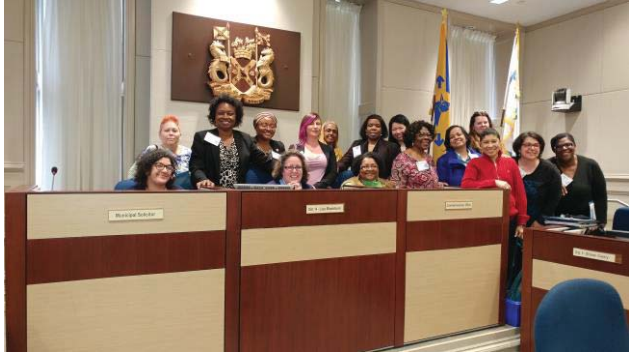
Participants at the Council Chambers, April 2017