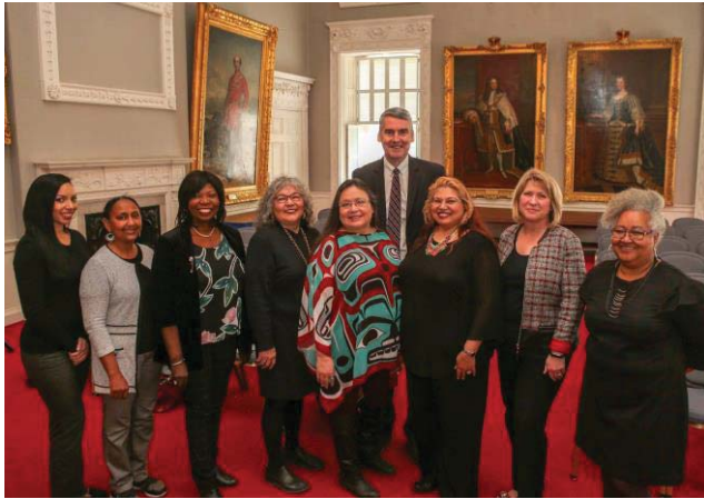
Members of Diverse Voices for Change recognized at the Province House for their work on gender equity, March 2018

campaign School curriculum. The subcommittee developed a communication plan resulting in vast interest in the campaign school registration. The developed curriculum will be piloted in May 2018, and then evaluated and adopted for the upcoming municipal election.