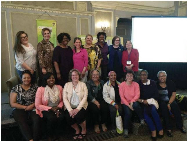
Members of Diverse Voices for Change at the Campaign School, May 2018