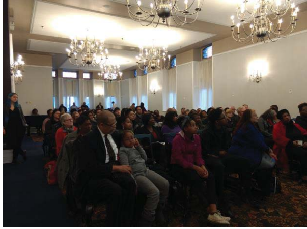
Audience at Sen. Wanda Thomas Bernard's session, November 2017