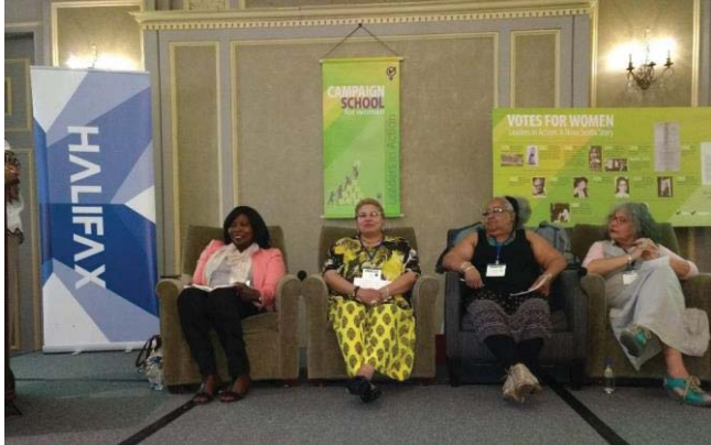
Diverse Voices for Change Panel at the Campaign School, May 2018

The Campaign School in May 2018, witnessed unprecedented interest from women in general with increased interest from Indigenous and racialized women. Approximately 200 women were interested in the school, of which 170 registered and 115 attended the school. It is worthy of noting that approximately 40% were Indigenous and racialized women. Indigenous and racialized women participated at all levels of the school not only as participants but as facilitators, panelists and mentors.