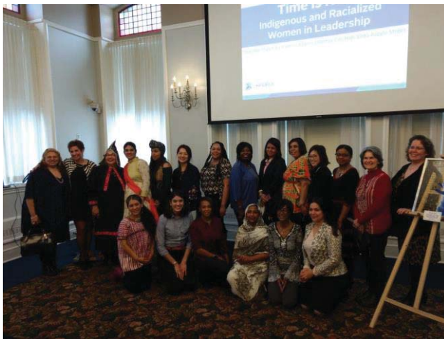
Some key players at the International Women's Day celebration, March 2018

On March 8, 2018, Diverse Voices for Change along with the African Nova Scotian's and Visible Minority Women's groups organized an event celebrating the International Women's Day. The event centred the experiences of Indigenous and racialized women in leadership and was attended by over 100 participants, gaining public and media attention and interest.