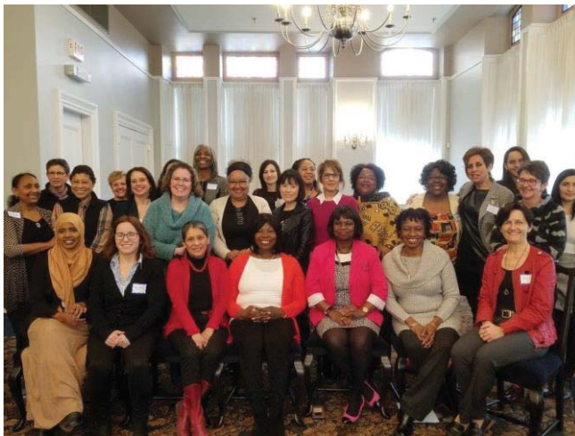
Outcome Mapping Session, March 2018

FCM organized a full day workshop with Indigenous and racialized women as well as municipal staff and partners to complete the Outcome Mapping for the project. The main objective of the outcome mapping is to leave HRM with a road map on gender+ analysis designed to address HRM' specific needs and context.