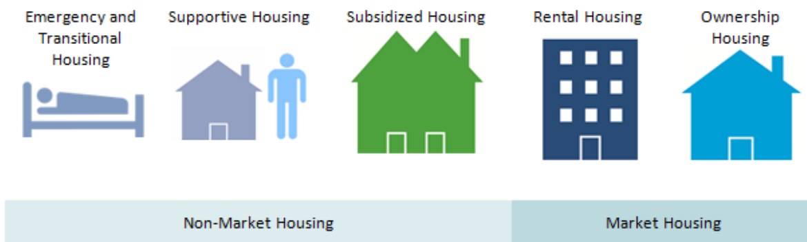
Figure 1: Housing Continuum

A 2015 study by the Canadian Center for Policy Alternatives and United Way Halifax established the living wage for Halifax at $20.10 an hour to ensure a standard of living that promotes well-being and social inclusion. The study also concluded that if more affordable housing was available to families, the hourly living wage could be lower.