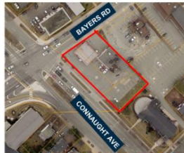
Site Boundaries in Red