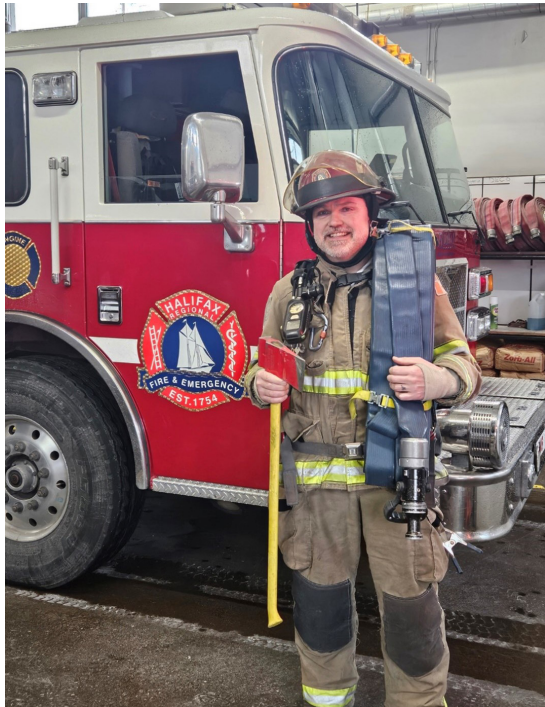
I spent the better part of a workday at Station No.5 (Bayers Rd) with a crew of hard-working firefighters. I was happy to learn about issues and challenges, and to feel just how heavy and uncomfortable firefighting gear actually is.