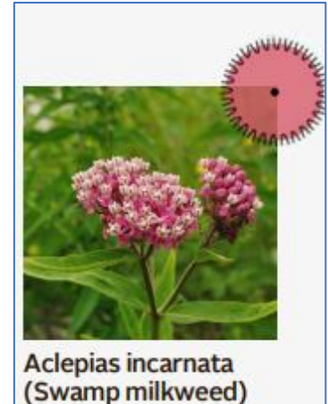
Aclepias incarnata (Swamp milkweed)

monarch butterfly. Planting gardens that support pollinators supports the whole ecosystem by providing food sources for birds and other wildlife and increases biodiversity in our communities.