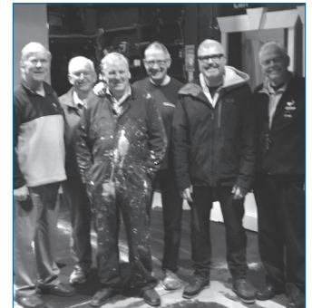
I spent a morning with the hard working volunteers of the Theatre Arts Guild at the Pond Playhouse.