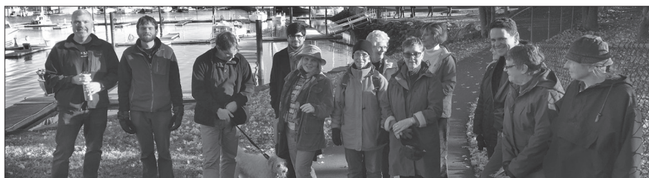
Walking, talking, and surveying the Arm with the Northwest Arm Heritage Association.