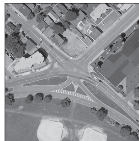
NORTH PARK, AGRICOLA, CUNARD

Neither of these intersections meet national transportation standards and both suffer from aging infrastructure, problematic traffic flow, frequent collisions, and poor connectivity. HRM has been exploring options for the redesign of these intersections and after a great deal of research is recommending roundabouts at both locations.