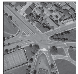
COGSWELL, NORTH PARK RAINNIE, AHERN, TROLLOPE

Olympic Community Centre 2305 Hunter Street, Halifax