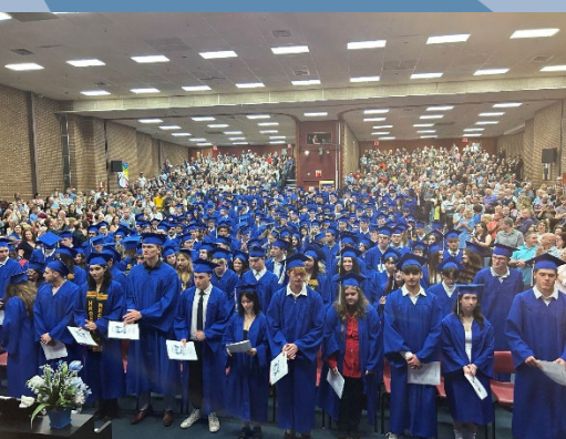
Congratulations to the Woodlawn High School Graduating Class of 2024. Go Panthers!!!!