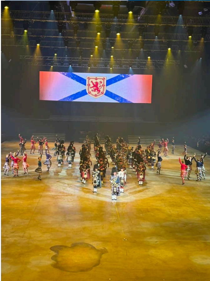
Royal NS International Tattoo is an amazing show.