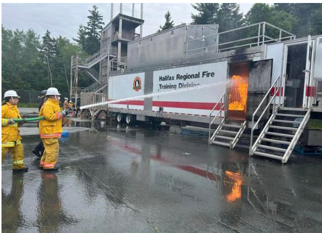
A great morning hanging out at Camp Courage.

Consider taking another route when possible and avoid the construction area and always obey the posted speed limit and signage when driving through construction zones. Speeding in a construction zone will result in a fine that is double that of a normal speeding ticket. Pay close attention to sign flaggers and obey their instructions and always be prepared to stop suddenly when driving through construction zones. Keep a safe distance between your vehicle and the construction workers' equipment and vehicle. Finally, stay calm and be flexible when encountering traffic delays.