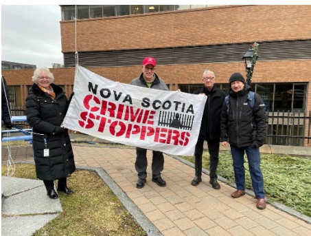
Flag raising for Nova Scotia Crime Stoppers. Thank you for all you do!

The deadline to apply for Halifax's Camp Courage is March 15, and applications are now open. You can find out more about this amazing organization here .