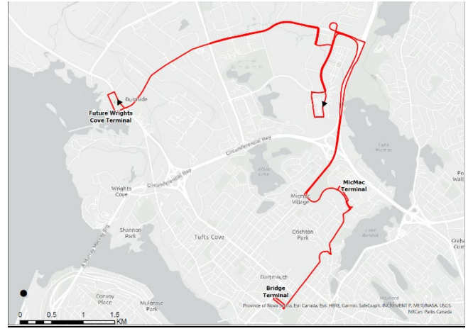
Route 56 Dartmouth Crossing