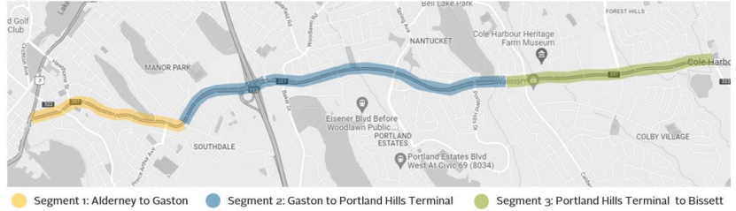
Figure 1: Map of Study Area

You can also complete an online survey, beginning April 29 until May 13, which will reflect what was presented at the Open House sessions including questions on the concept scenarios, trade offs, and future vision for the street.