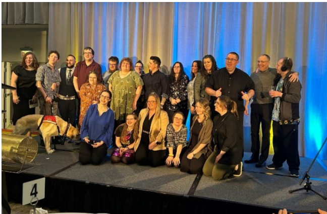
Had a great evening of laughs in support of DASC Industries.

April is the start of The Great Nova Scotia Pick Me Up is coordinated by the Nova Scotia Adopt-A-Highway program and supported in part by the municipality. The Great NS Pick Me Up is a community based, volunteer driven litter clean-up program. To find out more about the program go to our website .