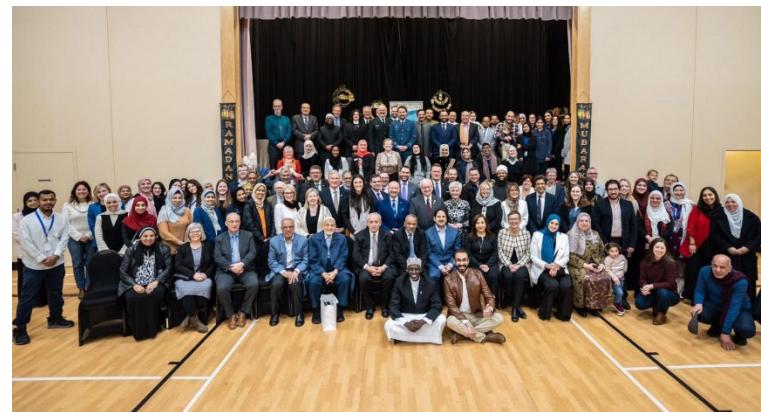
Attending an Iftar with some of our Muslim community!