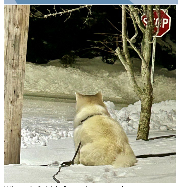
Winter is Spirit's favourite season!