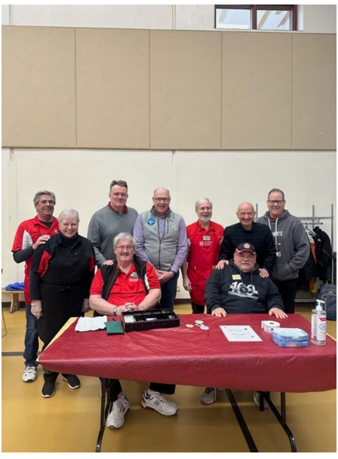
Kin Community Brunch at the East Dartmouth Community Centre!