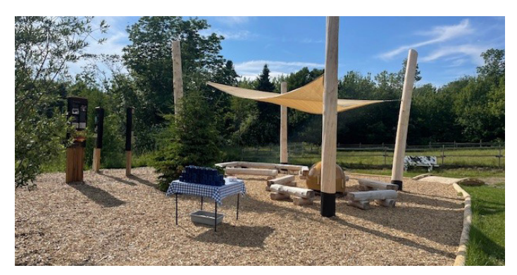
An image of some of the new Outdoor Classroom at the farm.

I was pleased to help contribute with district funds to the new Outdoor Classroom at the Cole Harbour Heritage Farm. If you have not been by to take a look, it is a great place to take your kids! The Outdoor Classroom is in dedication to Rosemary Eaton, a Photographer and Activist for heritage and the environment in the mid-20th century. There is fascinating information on the history of Cole Harbour displayed around the Outdoor Classroom. Lots of learning to enjoy!