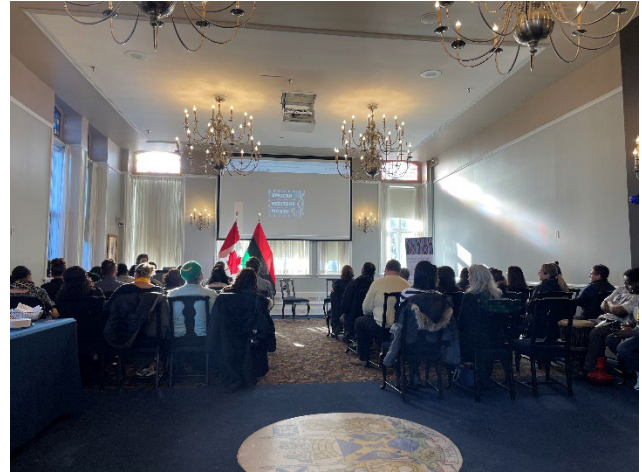
African Heritage Month Flag Raising and Opening Night Celebration

For information on all things municipal, please visit our website .