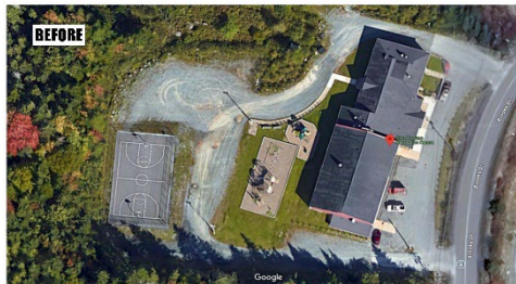
East Preston Bike Playground & Outdoor Fitness Park East Preston Recreation Centre