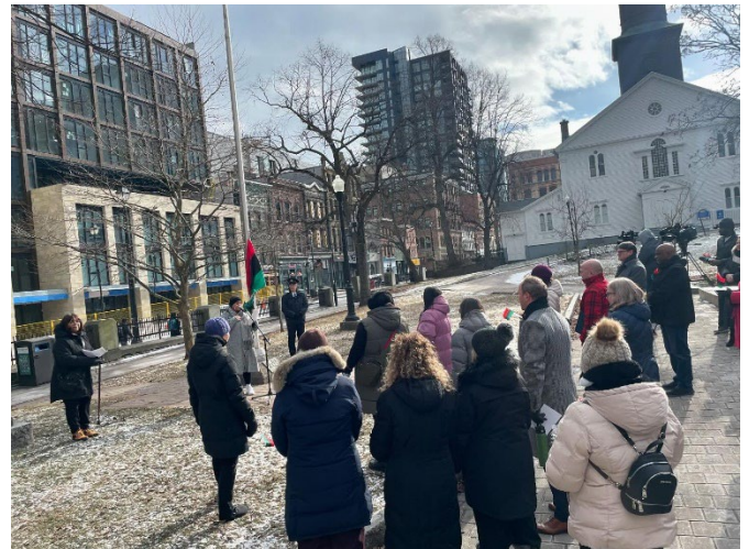
African Heritage Month flag raising at Grand Parade

This month, City Hall will be illuminated in black, green and red and the Pan-African flag will be displayed at some of our municipal buildings in honour of African Heritage Month. Take time to commemorate African Heritage this month by attending an event or checking out the Halifax Public Library portal featuring programs that celebrate the African Nova Scotian community .