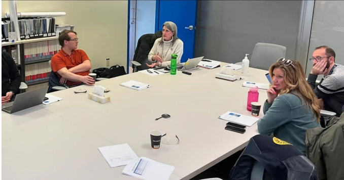
Lake Major Water Treatment Plant