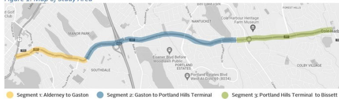
Figure 1: Map of Study Area

The second phase of the Portland Street – Cole Harbour Road Functional Planning Study has been initiated with a revised scope and deliverables towards project completion by summer 2024.