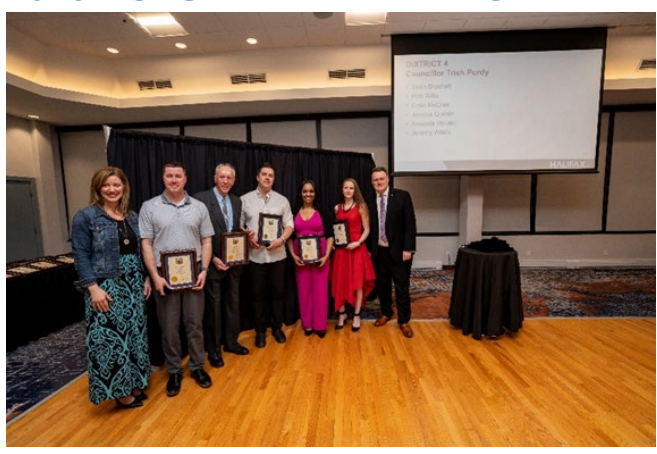
District 4 2023 Volunteer Award Recipients