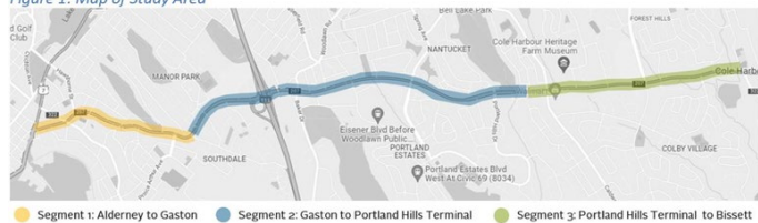
Figure 1: Map of Study Area

The second phase of the Portland Street – Cole Harbour Road Functional Planning Study has been initiated with a revised scope and deliverables towards project completion by summer 2024.