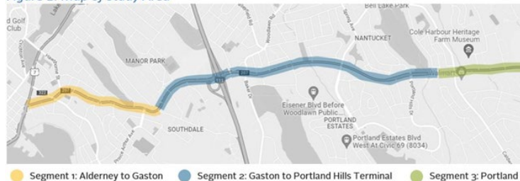
Figure 1: Map of Study Area

The second phase of the Portland Street – Cole Harbour Road Functional Planning Study has been initiated with a revised scope and deliverables towards project completion by summer 2024.