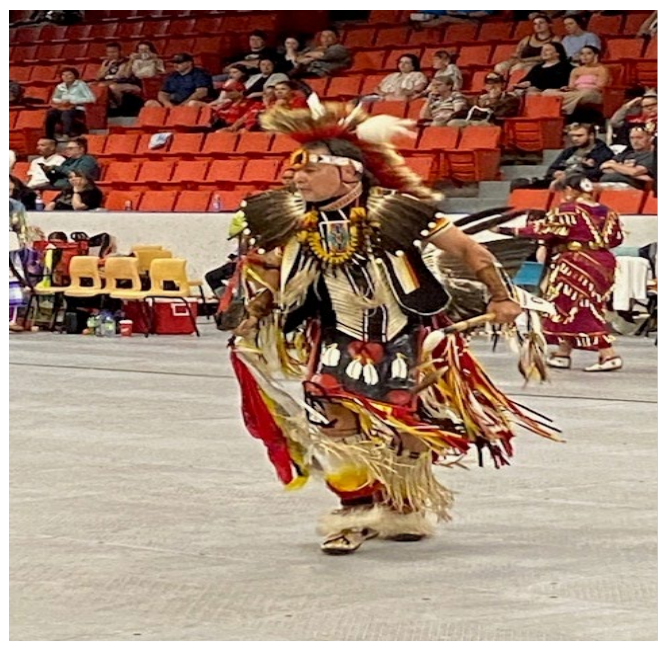
Mawita'jik Competition Pow Wow at Zaztman Sportsplex