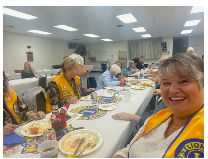
Lions Club Dinner!