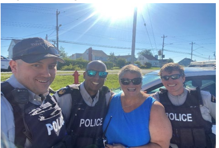
Local RCMP came to join in on the fun too!