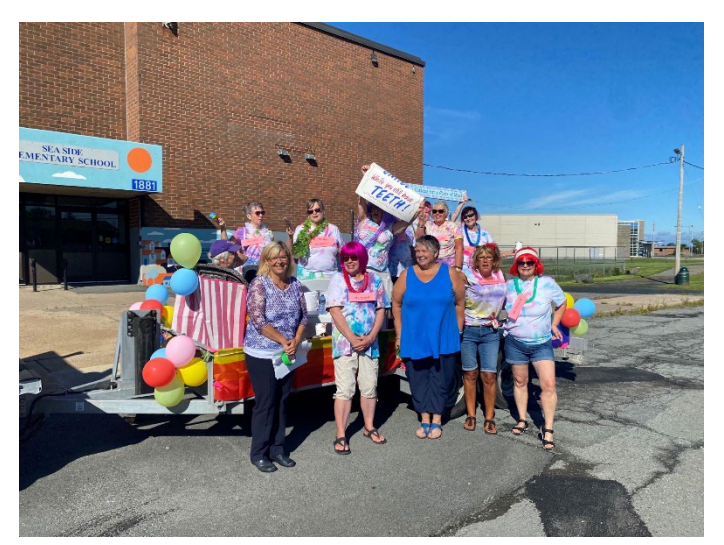
EPCB Summer Carnival Fun!