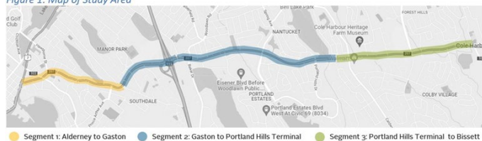
Figure 1: Map of Study Area

The second phase of the Portland Street – Cole Harbour Road Functional Planning Study has been initiated with a revised scope and deliverables towards project completion by summer 2024.