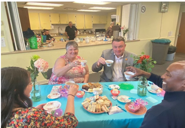
The Mayor and I at the Dartmouth South Senior Tea Social

There are no plans for further park development at the lake at this time.