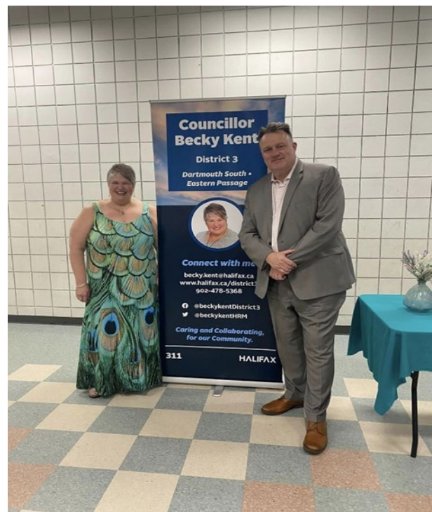
Eastern Passage Seniors Tea

Starting late spring/early summer, contractors will begin pre-construction set-up which will result in the closure of Hornes Road. Construction is expected to continue until late fall. There will be no through traffic for vehicles or pedestrians on Hornes Road and transit will be rerouted throughout the construction period. Latest updates will be maintained on this webpage as they become available.