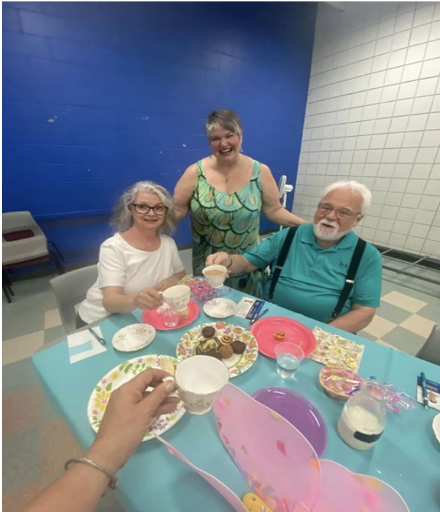
Eastern Passage Seniors Tea

For more information, read the staff report .