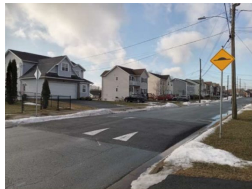
Example of a speed table

The Halifax Regional Municipality has provided more details about the traffic calming projects on Oceanview School Road, Aubrey Terrace and Oceanlea Drive. A review of these streets has determined that speed tables are the appropriate traffic calming measure for Aubrey Terrace and Oceanlea Drive while speed humps will be used for Oceanview School Road. Notices to the effected communities have been distributed with more information about any construction impacts. For more information on our traffic calming program, visit our website .