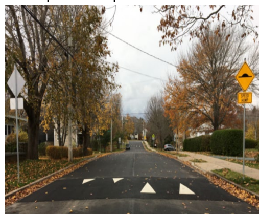
Example of speed hump