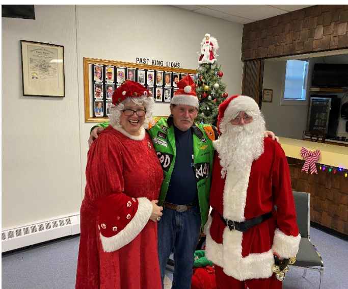
Christmas at the Lion's Club!