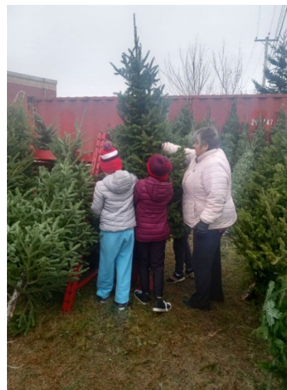
Taking part in Christmas festivities. Getting a Christmas tree!

During the meeting, after all the pre-registered speakers have been called, the Chair will call three times to ask if there is anyone else present who would like to speak. If you are present in the meeting room you can indicate your wish to speak at that time.