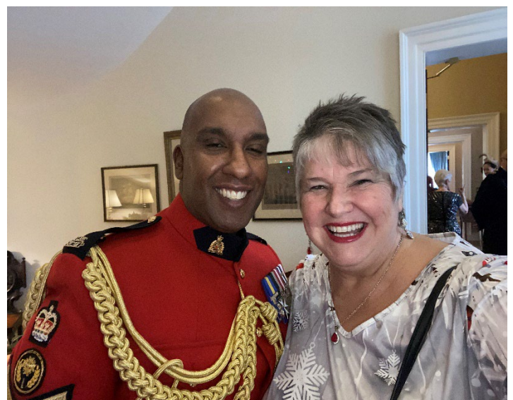
New Year Levee