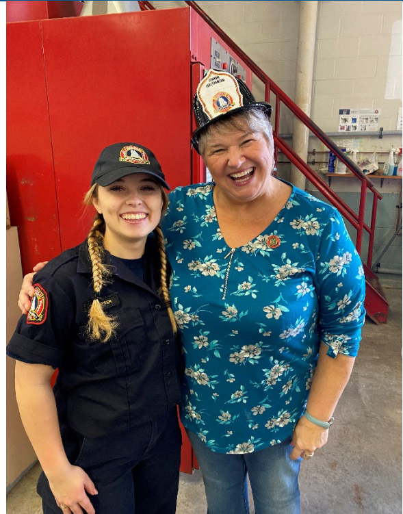
Eastern Passage Cow Bay Firefighters Association Open House

During every budget meeting, members of the public also have an opportunity to share their views on any aspect of the proposed municipal budget. You can speak directly to me as your Regional Councillor about budget priorities. During each meeting, time will also be set aside for the public to provide insight and comments. If you wish to make a presentation before HRM Council about the municipal budget, then please contact the Municipal Clerks Office at clerks@halifax.ca or call 902-490-4210. Written submissions are also welcomed.