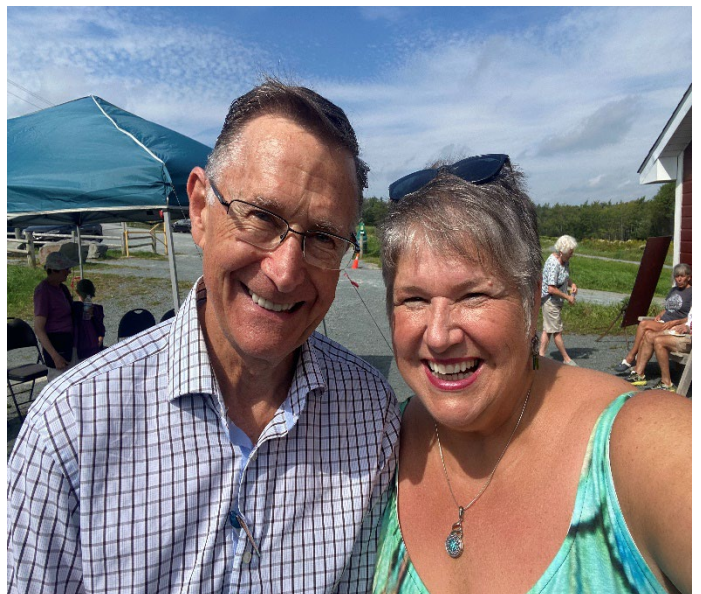
Cole Harbour Parks and Trails Association 25 th Anniversary