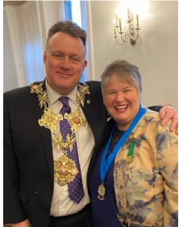
Mayor Savage and I

We all have a role to play in building a future where everyone can reach their full potential. Learn more about upcoming events in celebration of International Women's Day at Halifax.ca as details become finalized. Click here for more information.