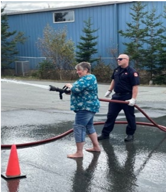
Eastern Passage Cow Bay Firefighters Association Open House at Station 16!