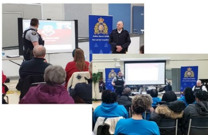
Halifax District RCMP Town Hall

There will be an RCMP town hall meeting taking place on Wednesday November 8 from 6-8p.m. at the Eastern Passage Cow Bay Lion's Club. I hope to see you there!