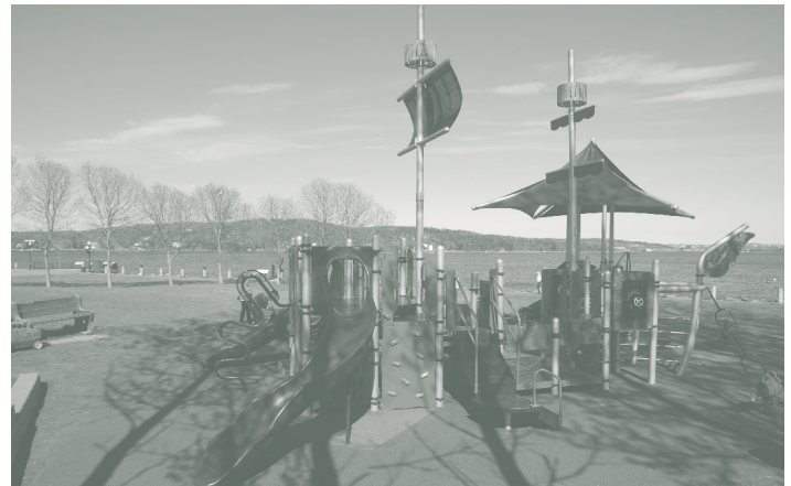
Dewolf Park playground

The playground in DeWolf Park received a complete rebuild last year and the response from parents, grandparents and kids has been great. The equipment is now up to code, and has improved visibility and accessibility, while maintaining its nautical theme. The upper playground in Ridgevale was also replaced, and there were repairs made to playgrounds in Oakmount, Peerless, The Ravines, Paper Mill, and off the Hammonds Plains Road. Additional equipment will be added again to the Oceanview/Nine Mile Drive playground, and planning and budgeting are underway to replace of the aging equipment in The Ravines and Bedford Hills playgrounds, within a couple of years. I also plan to work with residents in the Hemlock Ravines/Larry Uteck area to improve playground and green space in the area off Transom. A community garden is also possible, if desired by the residents in the area. Parents at Eaglewood School have begun fundraising for playground equipment, so I have earmarked some funds out of the District Capital Fund for this project.