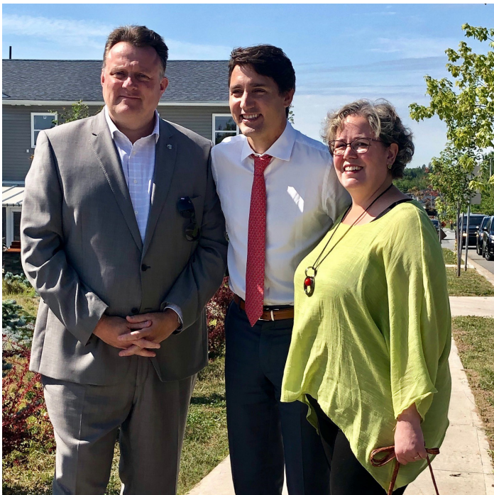
What a day it was welcoming the Prime Minister to District 14 and showing him around!