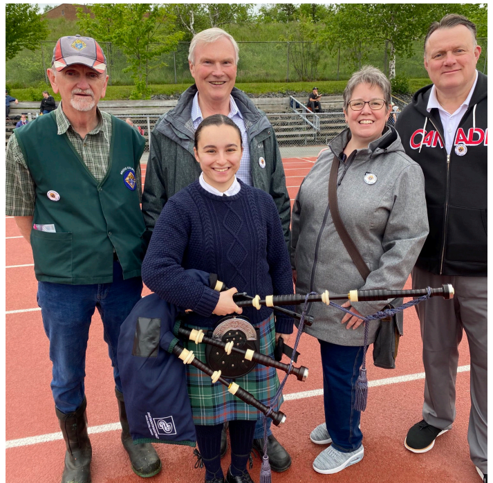
One of the highlights of my time on Council is supporting non-profits and service groups that do so much work in our communities.