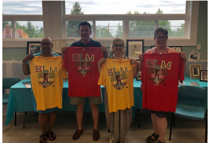
It’s been an honour to fight for Lucasville to secure their historic Black community boundaries.

For more information on becoming a candidate or applying to work the election please visit halifax.ca/election .