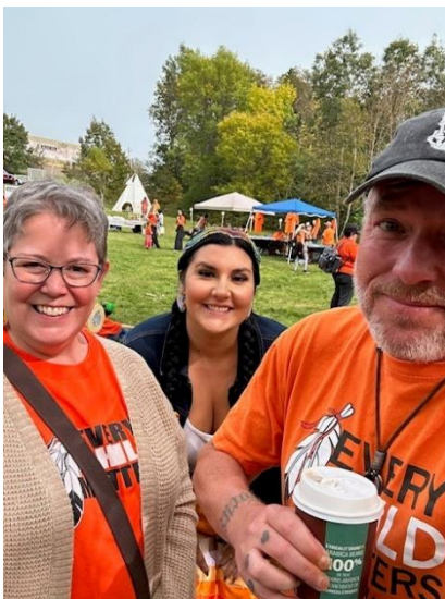
Great to be able to commemorate Truth and Reconciliation Day in Sackville thanks to the Kinettes !