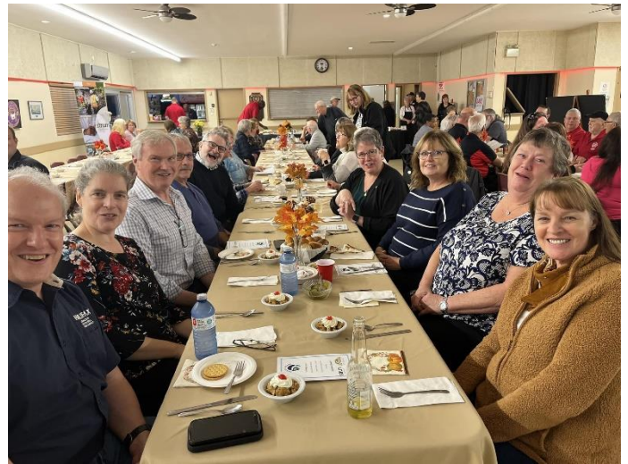
Joining other elected officials at the recent Sackville Rivers Association fundraising dinner