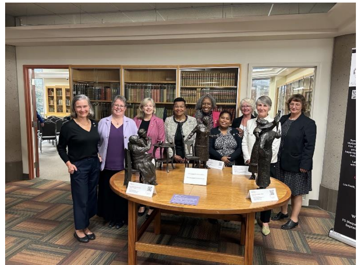
Celebrating the Famous Five statue and the advances women have made in getting elected to office at a recent reception at The Mount.