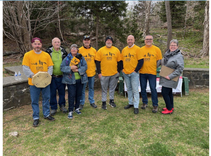
At the Steps for Life fundraising walk raising money to support families in the aftermath of workplace death.