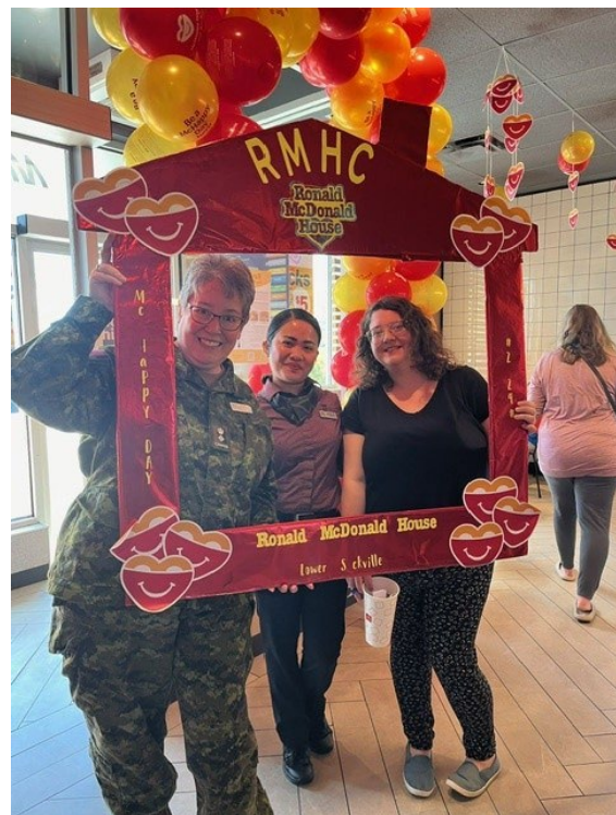
It was McHappy Day in Sackville and it was a pleasure to celebrate at the local franchise!