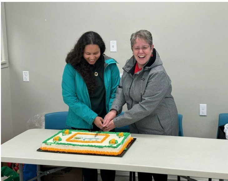
Having a laugh with the Chair of the Lucasville Greenway Society at the recent community walk and fun day