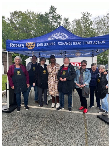
It was a damp but successful Rotary Recycle Your Cycle. Dozens of kids got new bikes for the summer!