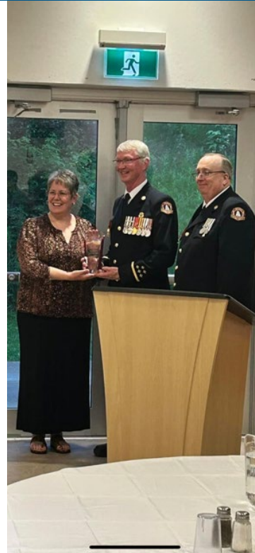
Proud to attend the recent awards ceremony for the Beaver Bank Kinsac Volunteer Fire Department