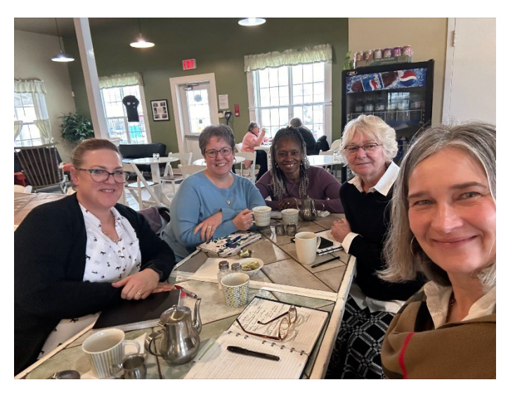
Gathered with some of my Council Colleagues to discuss policing issues with RCMP