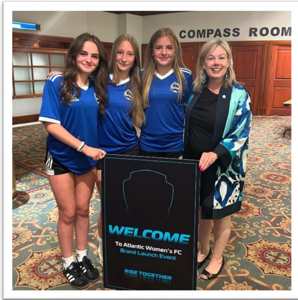
Excited to attend the launch of Halifax Tids FC, Halifax's first professional Womens's Football Club