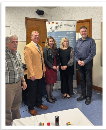
Attended the 23 rd annual German Settlers Day Celebrations in Dartmouth.