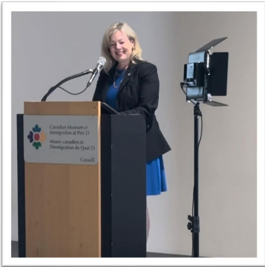
Attended the 49 th Annual General Meeting of Fédération des communautés francophones et acadienne du Canada and the 2024 Boreal Awards ceremony.