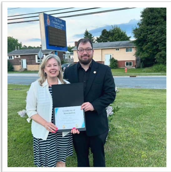
Attended the 1 st Annual Bravie's Awards ! Congratulations to all the Special Olympics athletes.