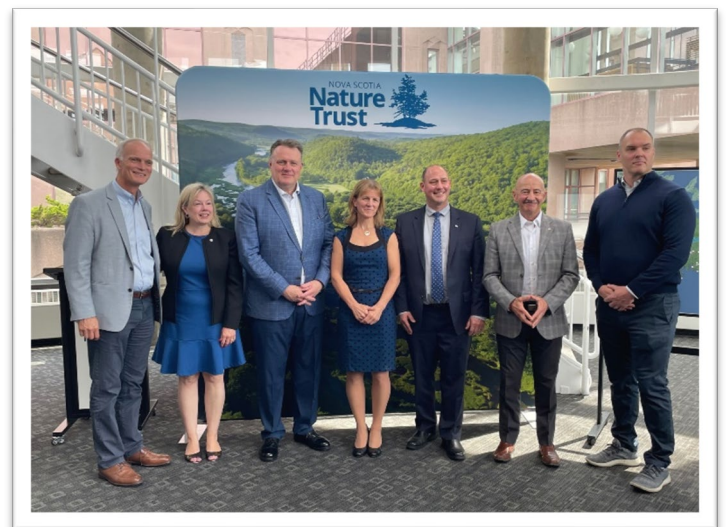
Congratulations to Nova Scotia Nature Trust on reaching their goal of protecing an additional 6,000 hectares of land across Nova Scotia