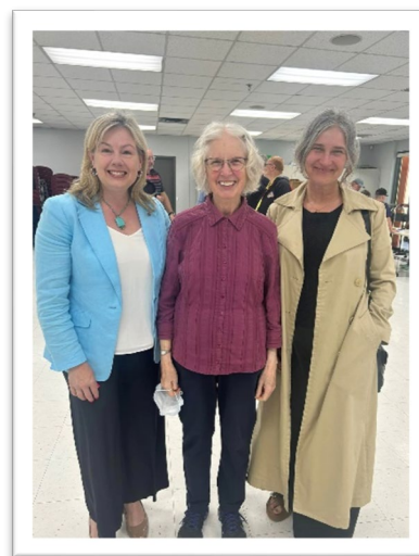
Attended the Open House for the new rink in Spryfield. Lots of good discussion about what this facility could look like.