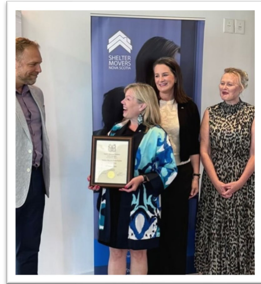
Honored to present a scroll to Shelter Nova Scotia in honour of their 5 th birthday ! So proud of all the volunteers