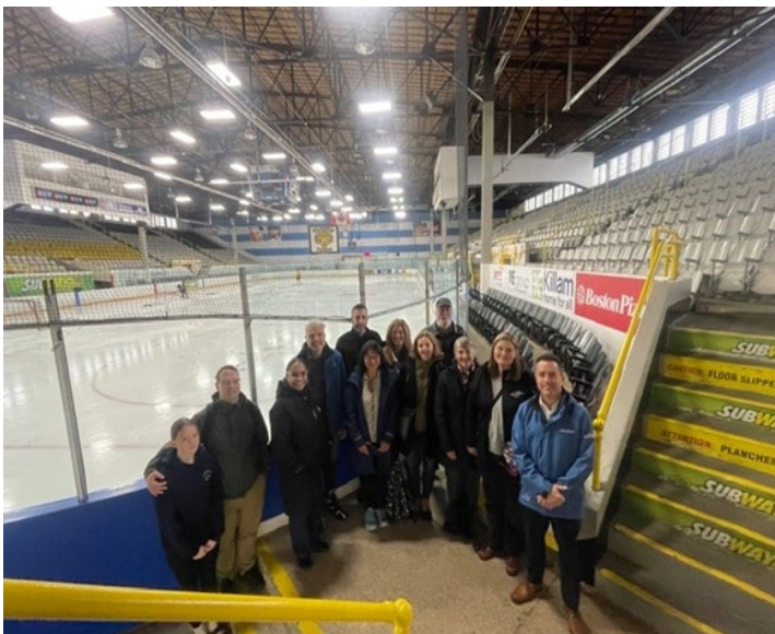
Tour of the Halifax Forum with my Council colleagues

Inquiries should be directed to 311 or Contactus@311.halifax.ca