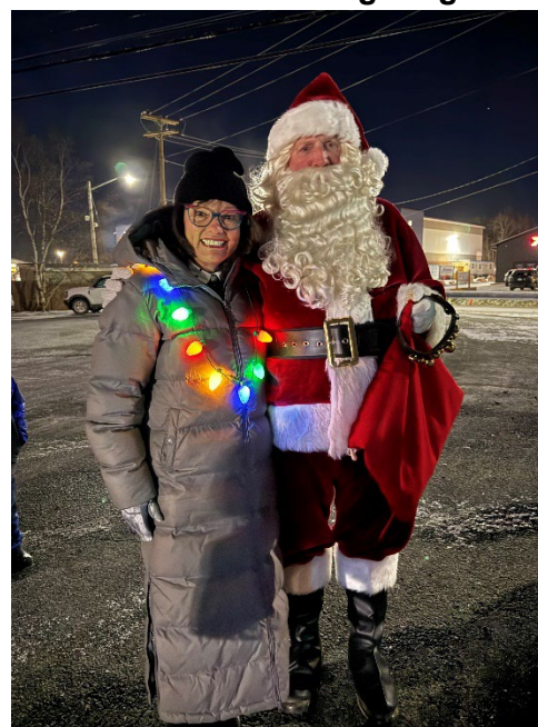
Hanging out with Santa at the BLT Christmas Tree Lighting!