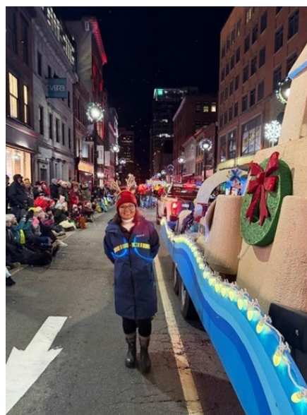
It was great to see everyone enjoying the 2025 Parade of Lights!