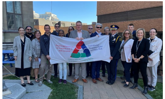
Health & Safety Week – May 8