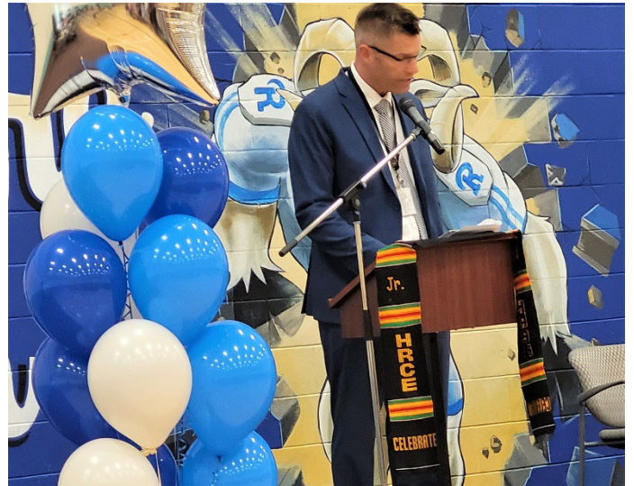
Ridgecliff Middle School graduation ceremony.