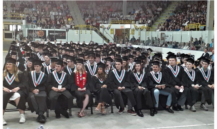
Bayview High School graduation ceremony.