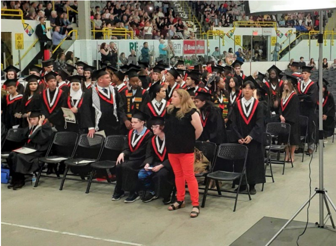
Halifax West High School graduation ceremony.