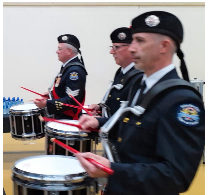
Halifax Regional Fire Fighters graduation ceremony.