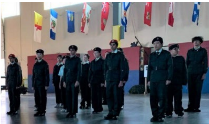
2632 Halifax West Royal Canadian Army Cadet Corp, Regional Cadet Support Unit (Atlantic) / Cadets and Junior Canadian Rangers graduation ceremony.