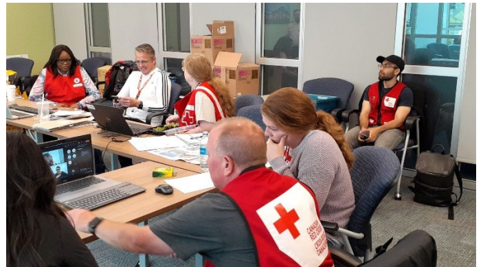
Wildfire volunteers at the Canada Games Centre.