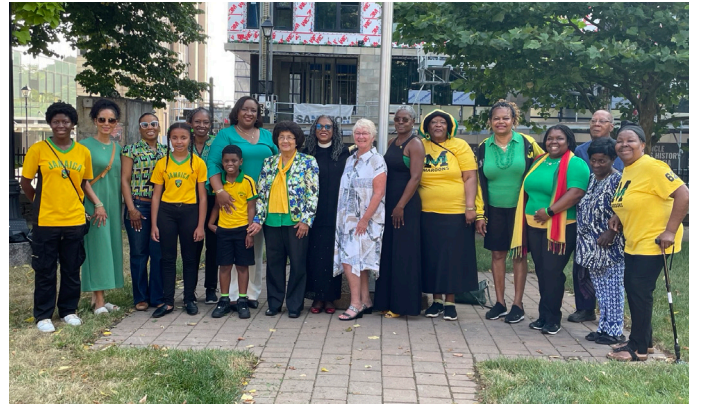
Flag raising for Jamaica's Independence Anniversary