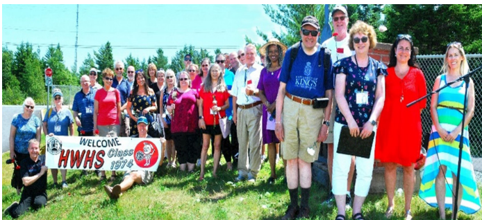
Halifax West High School 50th Reunion