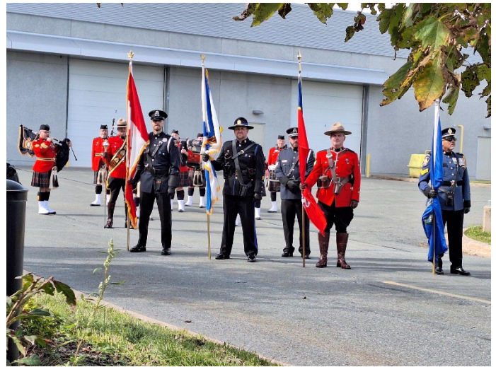
Fallen Peace Officers memorial Service