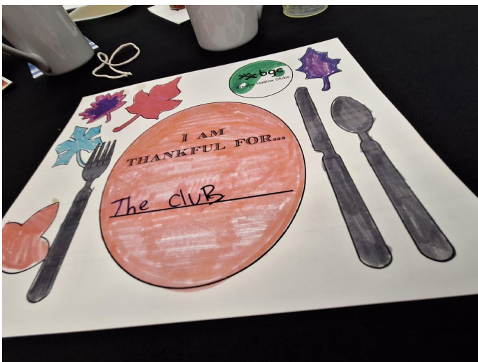
A visit to the Boys and Girls club at Thanksgiving