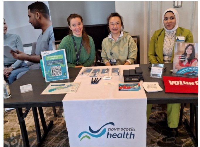
I had a great time at the Know your Municipality event on October 14!