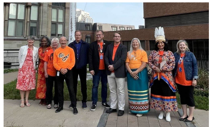
Attending the National Day for Truth and Reconciliation Flag Raising at City Hall