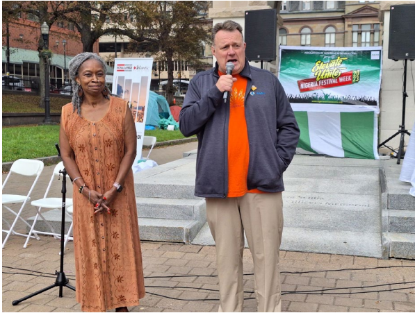
A wonderful time at the Nigerian Flag raising event.